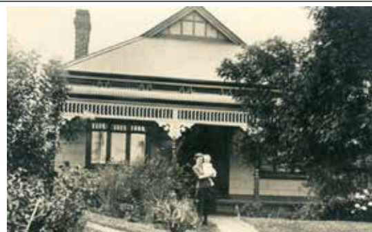
96 Emo Road (undated) MP61976