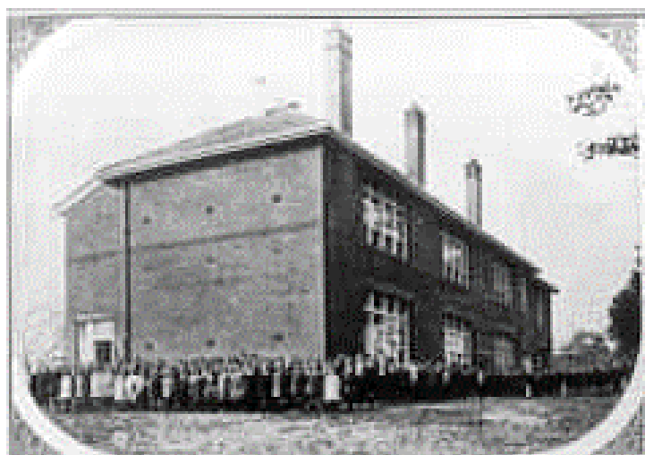
State School, Belmont Avenue Gardiner c1918