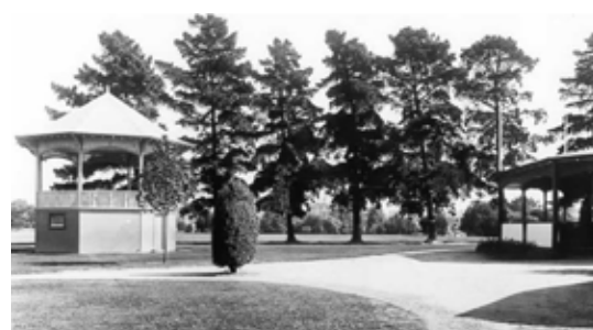
Bandstand, Central Park, Malvern East c1923