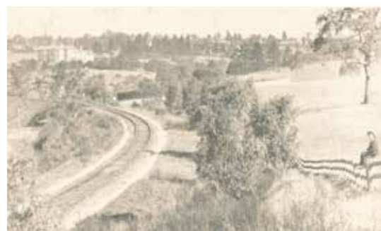
Early view of Toorak c1900 Stonnington History Collection MP15097

Bookings essential: Lorraine 9885 9082 by 15 February. All welcome!