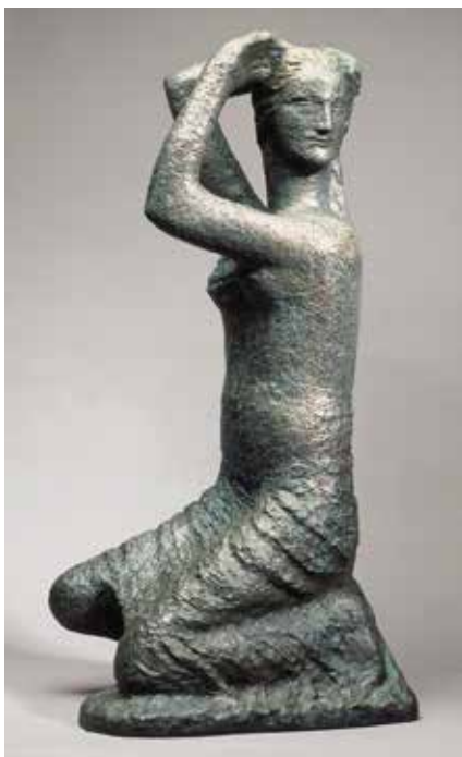
Koré Karl Duldig 1976