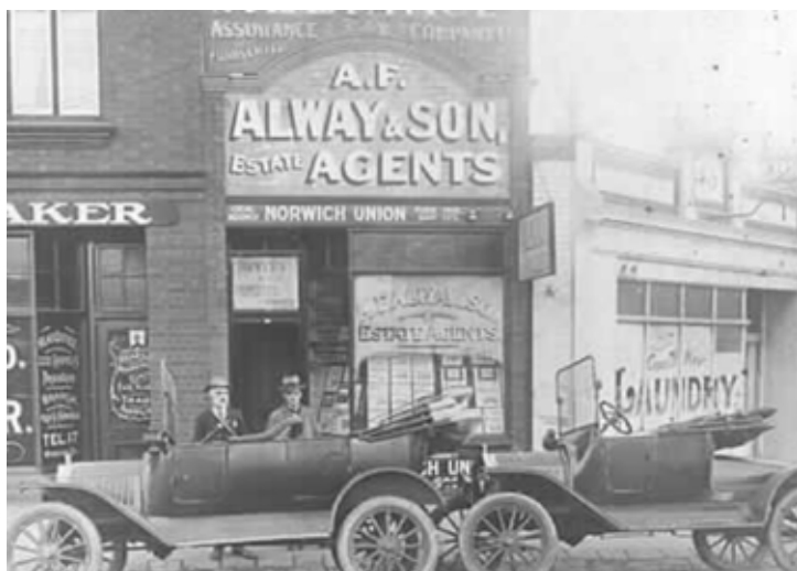
Alway's real estate agency c1918