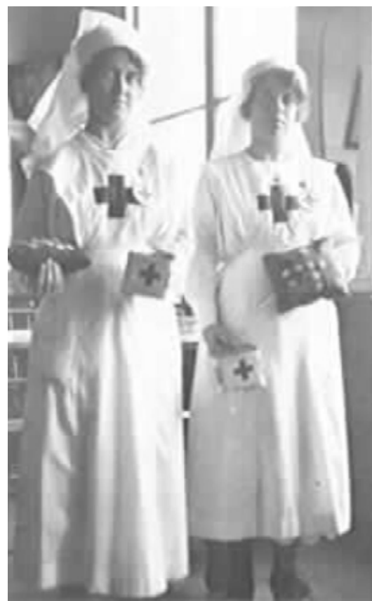
Wartime fundraising c1918 Stonnington History Collection PH8507