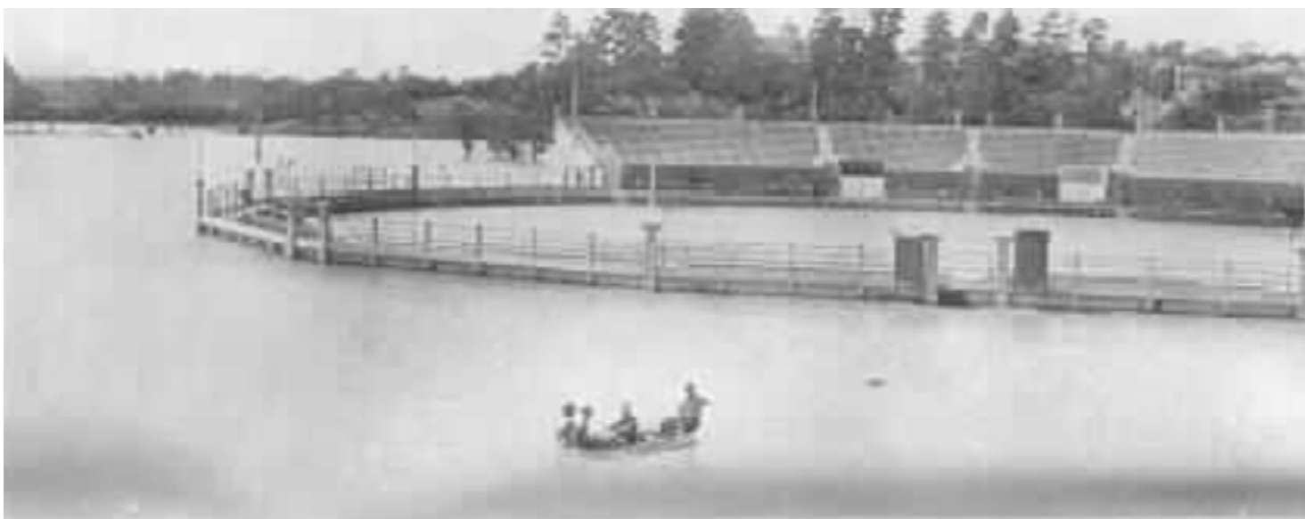
Kooyong Tennis Stadium in flood from water from the Yarra River and Gardiners Creek. 1934

In 1988 the LTAV changed its name to Kooyong Lawn Tennis Club. The stadium continues to host major tennis tournaments and other sporting and cultural events, maintaining the tradition of the Club as an internationally significant venue.