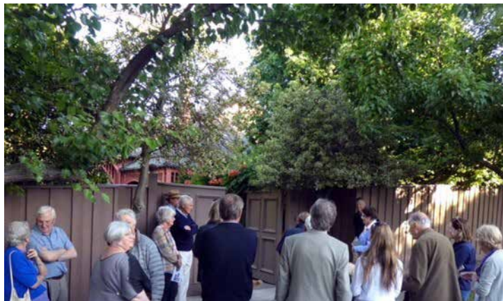
Monaro Road Kooyong walk December 2018