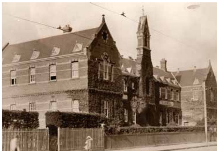
Hawksburn State School c1929 PH60621

The City of Stonnington celebrates the people, places and events that have shaped the area's history by placing commemorative markers at significant sites across the City. There are now more than eighty heritage markers. Some of the most recent heritage marker installations include the former Malvern Fire Station, now the Fire Station Print Studio, the site of the old Prahran High School on Orrong/Romanis Reserve, Korowa Anglican Girls' School, the site of the demolished Everton/Ranfurlie mansion, and the former Hawksburn Primary School, now used as an auction house. www.stonnington.vic.gov.au/Discover/History/Heritage-Markers