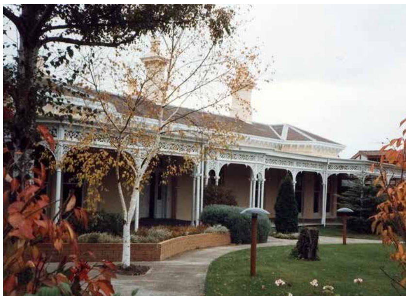
Flete, Flete Avenue Armadale 1992

Stonnington's Strategic Planning Unit is responsible for the development of land use and planning policies and strategies and administering and reviewing the Stonnington Planning Scheme. The identification of buildings and areas of heritage significance and their protection in the Planning Scheme relies on studies and reports prepared for the former Cities of Prahran and Malvern, and more recently for the City of Stonnington. Additional information can be found on the City of Stonnington website including information on the former Cities of Prahran and Malvern Heritage Studies (1983-1993), City of Stonnington Heritage Strategy (1994-2004), City of Stonnington Heritage Strategy (2005 onwards), Heritage Review Action Plan, Heritage Precinct Gap Study (2006-9) and the current City of Stonnington Heritage Strategy (2005 onwards). http://www.stonnington.vic.gov.au/Vision/Strategic-Planning/Structure-Plans-and-Urban-Frameworks/Heritage-Strategy