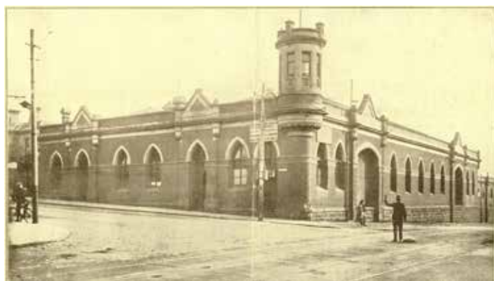
Cable tram engine house 1929 Stonnington History Collection SHC70029

The engine house was later substantially re-modelled and became Capitol Bakeries, and later the Fun Factory. It was demolished in 2016 to make way for the Capitol Grand apartment complex.