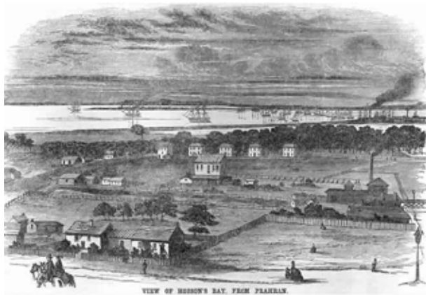
Hobson's Bay from Prahran 1864

The Melbourne Directories, including the Sands and McDougall postal directories, are finally being digitised. The Melbourne directories are a comprehensive listing of city addresses and occupants organised alphabetically by streets across the central city. It is augmented by alphabetical, trade and professional listings, as well as information on leading financial, government, official, ecclesiastical, legal and municipal institutions, and other miscellaneous advertisements, maps and information. The directory includes town as well as suburban listings, with coverage including Melbourne proper and, from year to year, the expanding suburbs of the greater metropolitan region and across Victoria. The scanned collection currently spans directories from 1857 to 1880. Due to size constraints, each yearly directory is broken up into multiple files.