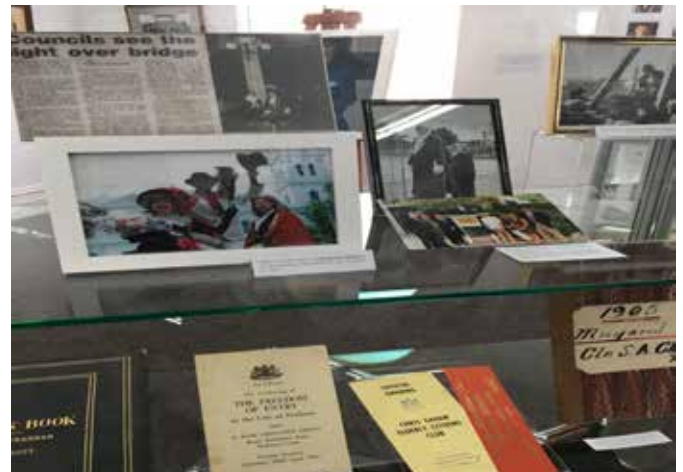
Former Malvern Council items, 'The Mayoral Office: more than robes and chains' exhibition. 2017