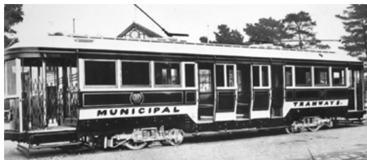
Tram, Wattletree Road East Malvern c1913