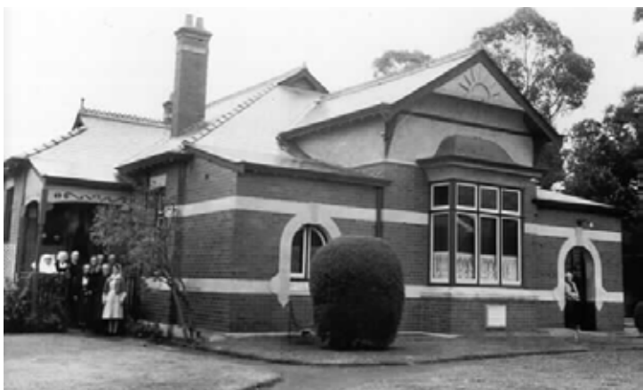
Weeroona, Waverley Road Malvern East c1928 Stonnington History Centre - MP350