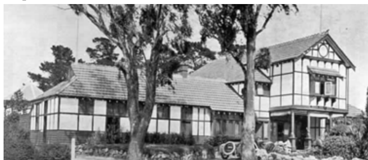
Central Park Kiosk 1921

The image appears to have been taken with the Central Park Kiosk in the background. The timber-framed kiosk, with a large refreshment room and accommodation for a caretaker, was constructed on the corner of Wattletree and Burke Roads Malvern East in 1911. The supper room was added in the 1920s and dances, meetings and receptions were held at the kiosk, until the poor state of the building led to its demolition in 1973. The Kiosk photo was first published in the City of Malvern Annual Report 1921-22.