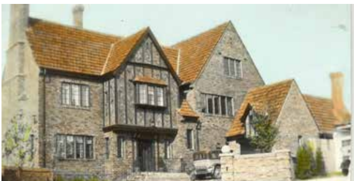
2 Ledbury Court Toorak c1930 MP 57239

Bookings: Lorraine 9885 9082 Members: Gold coin. Non members: $5 All welcome!