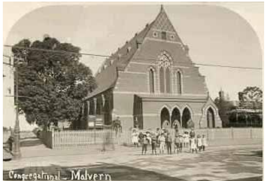
Congregational Church Malvern Stonnington History Centre - MP4

In 1885, land for a new church was purchased in Glenferrie Road on the south east corner of Winter Street. The memorial stone was laid in 1886. The church was built to the design of architects, Billing & Son. A second foundation stone was laid when the building was extended in 1889. The Malvern Congregational Church was demolished in 1966 to make way for Coles Supermarket.