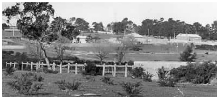
Manning Road Malvern East 1912. Stonnington History Centre Collection MP 2666