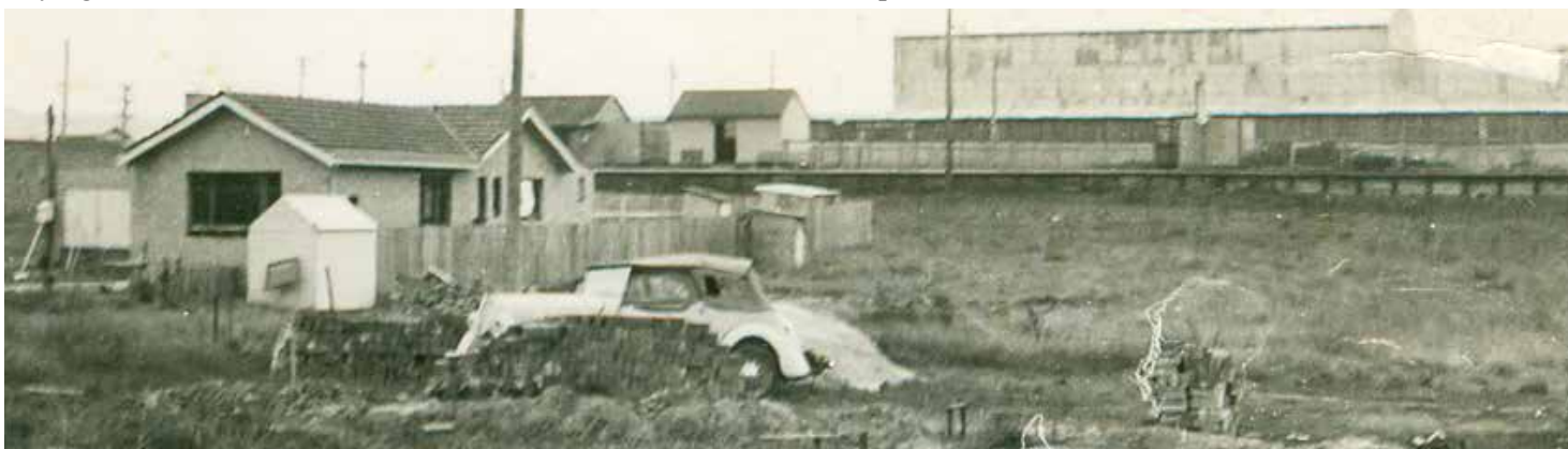
Argyle Street Malvern East c1955 looking south towards Holmesglen Station and the Holmesglen Housing Factory.

The railway line from East Malvern to Glen Waverley was opened in 1930. Passengers from the city had to change trains at East Malvern. A single double-ended Swing Door carriage ran from East Malvern to Glen Waverley, referred to locally as the Flying Matchbox. It consisted of a first-class and a second-class compartment.