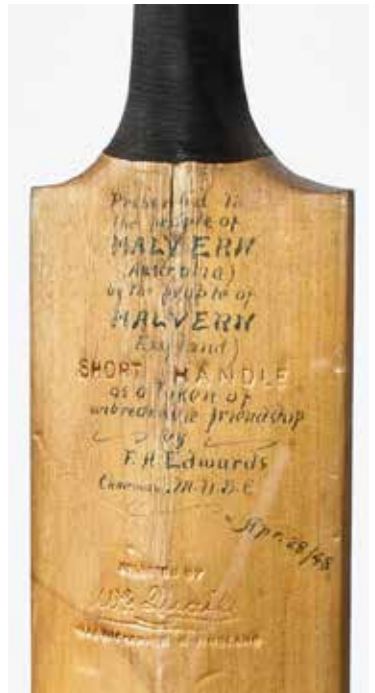
Malvern Cricket bat 1948

Chairman, Malvern Urban District Council