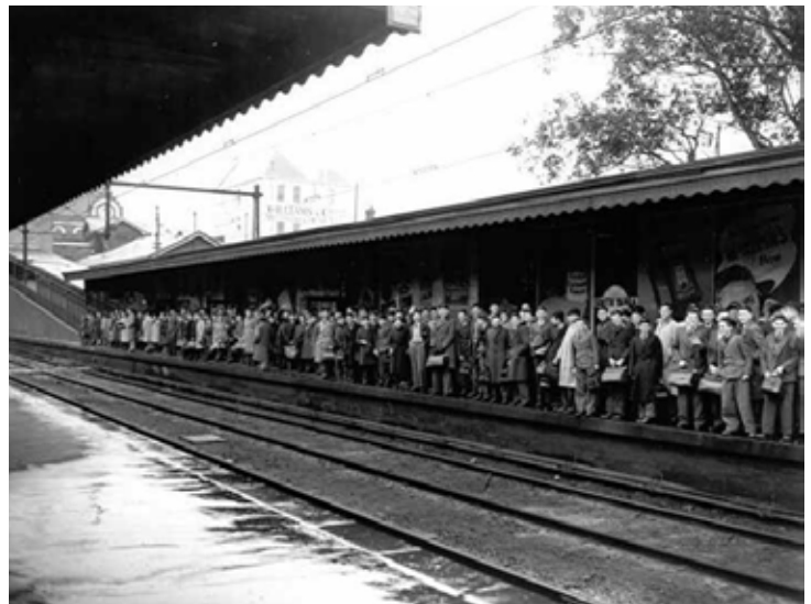
Melbourne High boys on South Yarra station (undated) Stonnington History Centre - PH887

Russell Jones, a former student at Melbourne High School, was interested in our article on the origins of the site of the school. "When I was there in the late 1970s, the building was falling into rack and ruin. In the dungeon classrooms at the south end of the building, the plaster was falling off the walls, and there were large gaps under the window frames. In winter, when there was a rainy south westerly blowing, the cold wind would whistle through the gaps, and the rooms were freezing. No wonder the teaching staff always wore their academic robes. There were also the twin challenges of the yeast factory in Yarra Street, and the Rosella factory across the river – if the wind was blowing in the right direction, the school would be enveloped in either a miasma of tomato soup, or the gut-wrenching reek of yeast. I much preferred the tomato soup. Today's students don't know what they are missing.