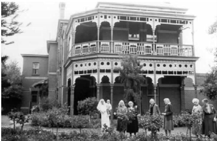
Brightside, Waverley Road East Malvern c1940

By the end of 2016 the site had been cleared and Regis Aged Care built Regis East Malvern, a new luxury aged care facility.