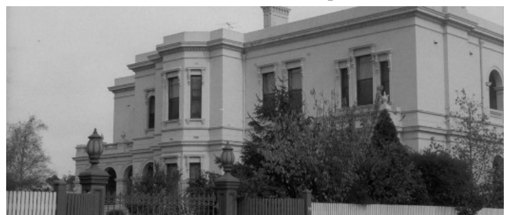
Southdean c1965