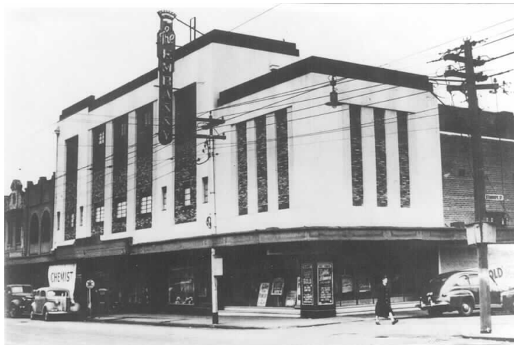
Embassy Theatre, corner Glenferrie Road and Stanhope Street 1948.