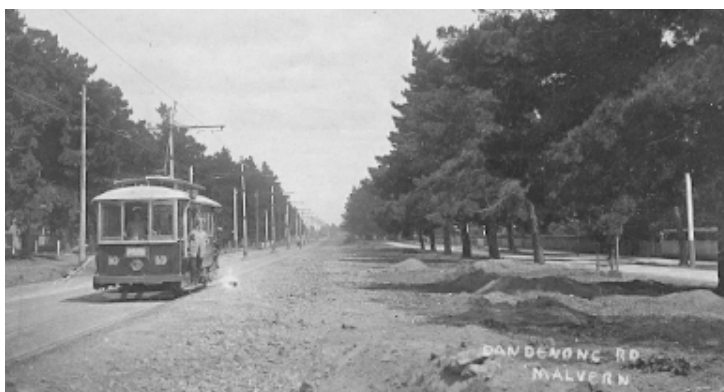
Dandenong Road Armadale 1911 Stonnington History Centre - Reg no 60713

Con R. Dodman wrote on the reverse side of the first photo 'All of these fine big trees are taken down and Sharp the Timber Merchant has bought them. The councils are making a roadway each side and the tram lines will come down the centre of rockwork and lawn. So it will not look too bad when it is finished. Travellers say when it is finished it will make it one of the finest roads in the state'.