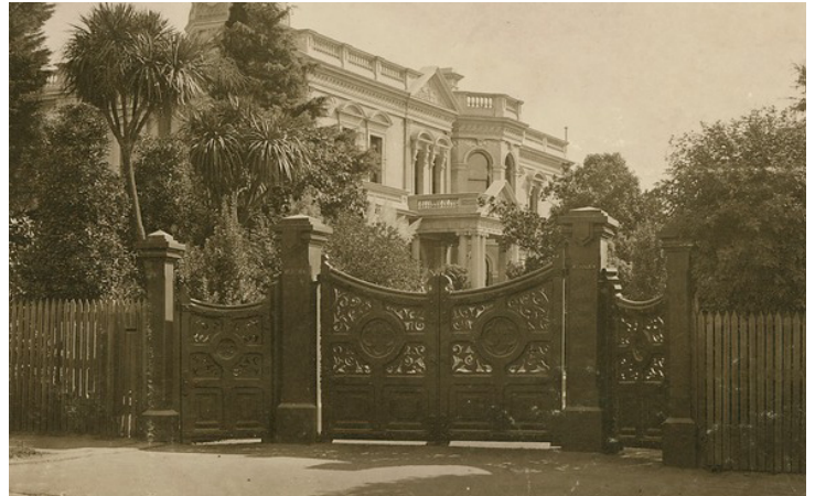
Werndew 1910 (SLV) http://search.slv.vic.gov.au/MAIN:Everything:SLV_VOYAGER2180084

The house had to be cleaned and cleared for sale. The cleaners were very thorough. On top of a wardrobe they found a bag of sovereigns. They found a large wad of notes in old socks stuffed into a lounge chair and a jewel case filled with jewellery in a mattress. There was a safe without key, perhaps left from their father. It was opened by a locksmith. It contained a hoard of sovereigns. The cellar was stocked with vintage wines, apparently untouched by the sisters.