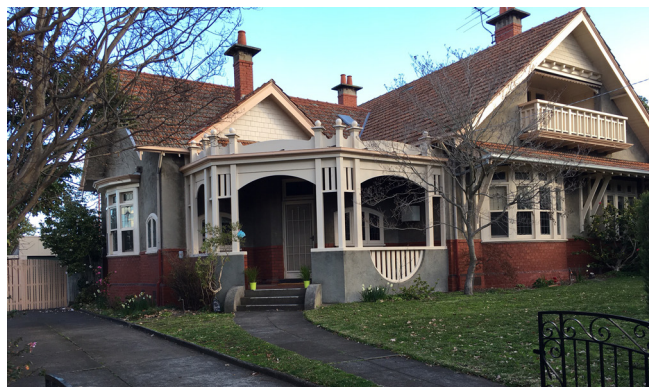
214 Wattletree Road Malvern 2017