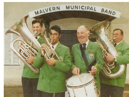
Malvern Municipal Band 1993 Stonnington History Centre - Reg no 57167

Umina (CWA) 3 Lansell Road, Toorak (Undated) Stonnington History Centre - Reg no 2482