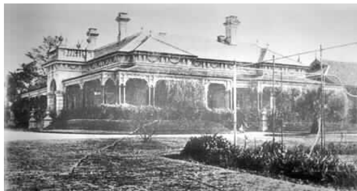
Northbrook, High Street Malvern 1929