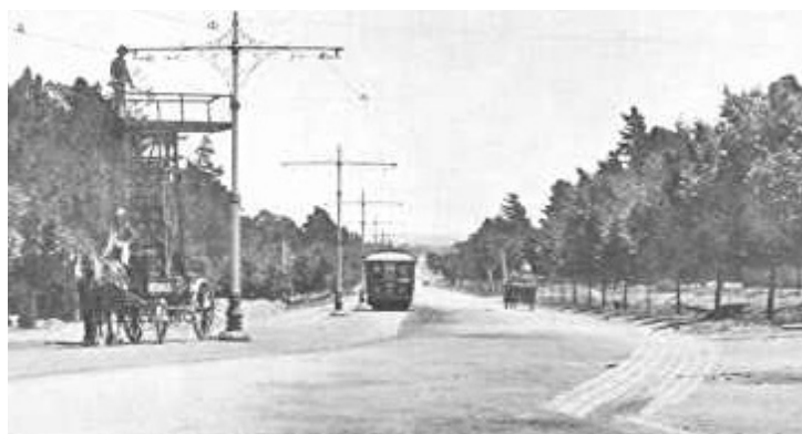
Dandenong Road looking West 1911 Reg no 9129