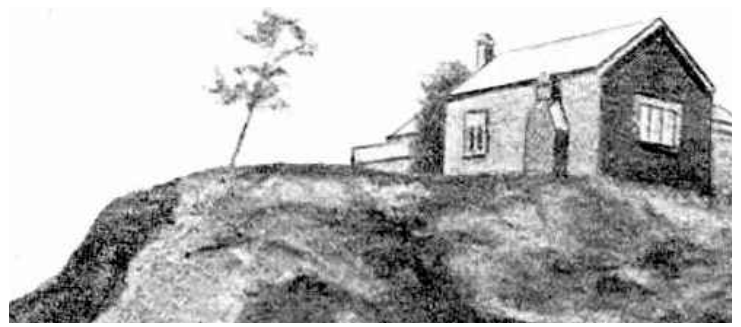
Waterloo Cottage c1925

The area was very wet and swampy. The Yarra overflowed often, and a stream rising from near Dandenong Road and Kooyong Road flowed diagonally across Toorak Road and Chapel Street before flowing into a large swamp. This area is now the school oval. Water from the other side emptied from Darling Street and Yarra Street on to the flat swamp below, ‘making a bog where the MHS sports ground is now located’.