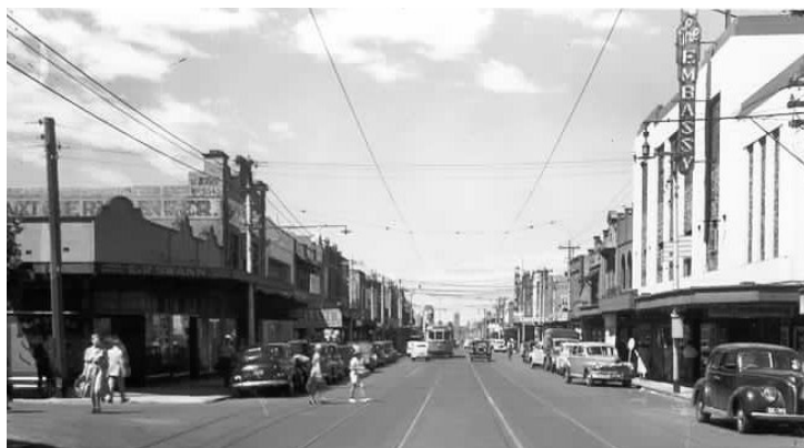
Glenferrie Road Malvern c1950 Stonnington History Centre - Reg no 4507