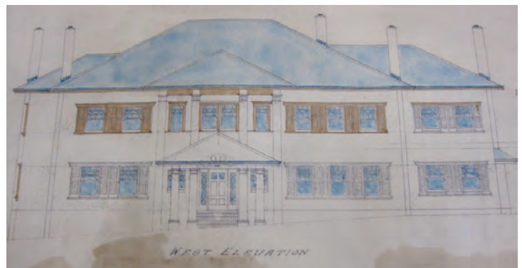
Plan of Glencairn 408-412 Glenferrie Road, Kooyong 1924 Reg no 62045