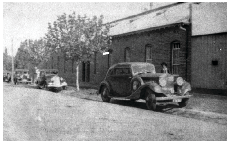
Gilpin's warehouse Belson Street East Malvern c1934 Reg no 62048