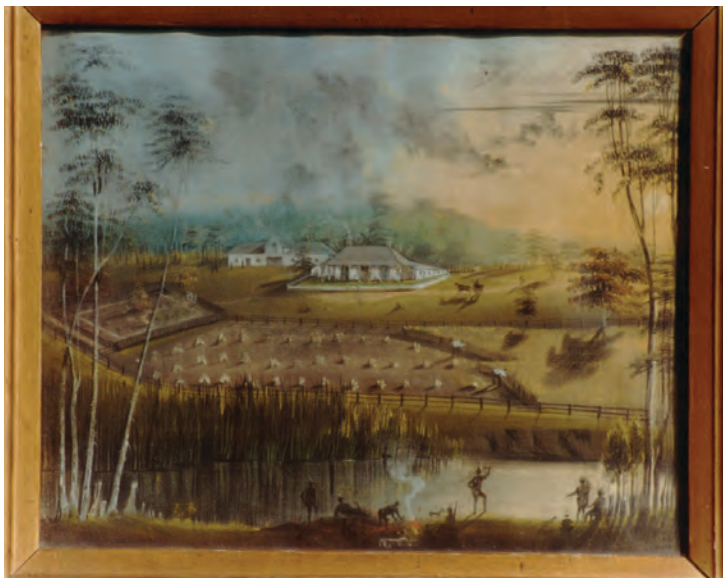
Glenferrie c1850s Reg no 8055