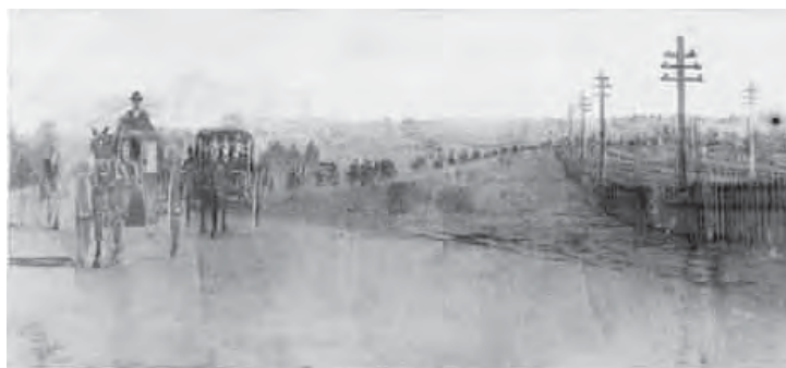
Hansoms & four wheeler cabs in 1890 after the races c1890 Reg no 710