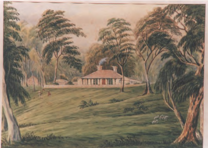
Glenferrie c1840s Reg no 8054