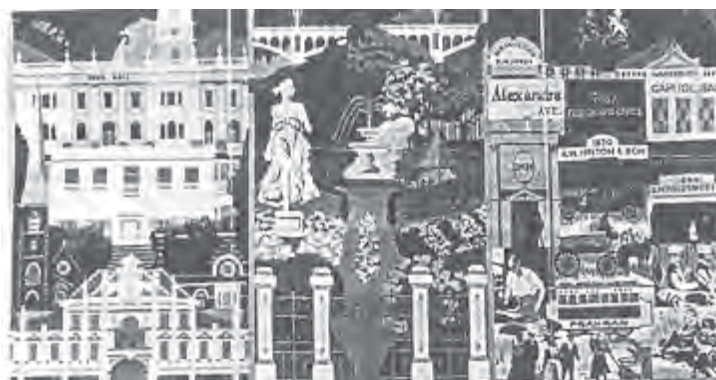
Section of Prahran commemorative tapestry 1985 Reg no 13683