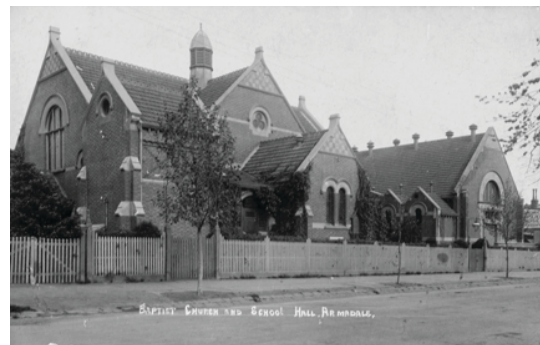
Baptist Church and school hall Armadale c1910 Reg no 9705