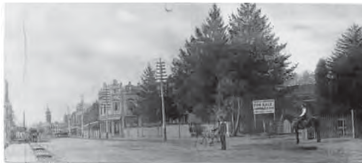
Glenferrie Road looking north 1890 Reg no 515