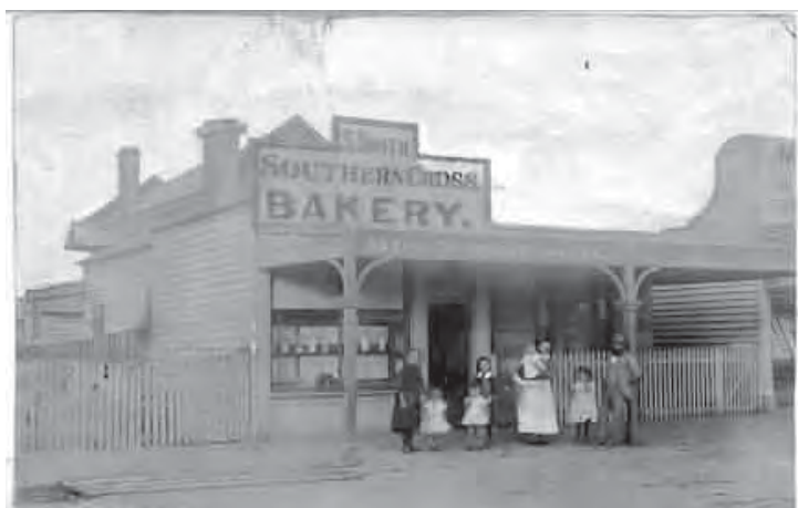
The old Southern Cross Bakery in Station Street Malvern 1892 Reg no 5096