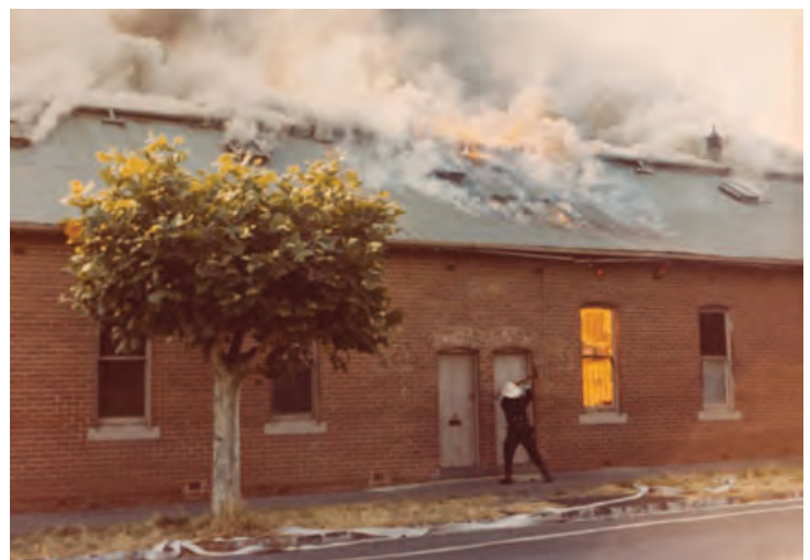
Fire at 5 Belson Street East Malvern 1973 Reg no 13502