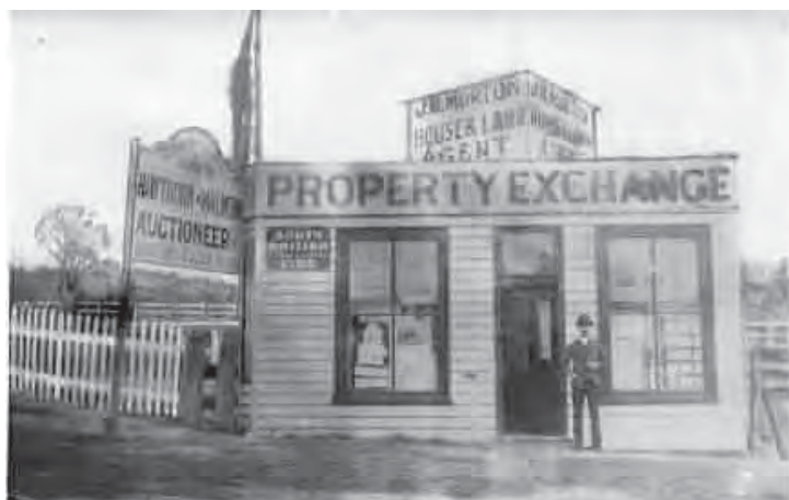
'A relic of the land boom, J. R. Morton's office next to Tooronga Station' 1890 Reg no 1214