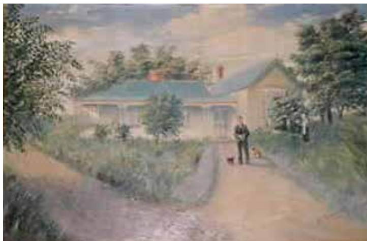
Painting of Chadstone 1904 Artist: B J Bainbridge Reg no 756

Prior to 1952 various postal district names were used in different areas of the former suburb of Chadstone, including Oakleigh, Carnegie North, Malvern, Malvern East and Murrumbeena. In 1928 Carnegie North covered most of the Malvern municipality east of Belgrave Road. Locally however it was known by the residents as East Malvern. In 1946 a gathering of Malvern ratepayers east of Belgrave Road formed the East Malvern Citizens Association. The Postal District name continued to give problems. In 1952 it was decided by the Association to propose a name change. As Chadstone Road was the main traffic road through the centre of the area, the name 'Chadstone' was suggested. The Post Office approved the proposal and the name was changed later that year. (The Post Office took the opportunity to extend the name Chadstone to Huntingdale Road to be served by a newly established post office in Warrigal Road). In 1989, 224 Chadstone residents presented a petition to Malvern Council requesting that the name Chadstone be changed to East Malvern. Following various polls and much local debate, in October 1991 the Minister of Finance approved the proposal to rename Chadstone to East Malvern. The new name extended through to Warrigal Road, the eastern boundary of the City of Malvern.