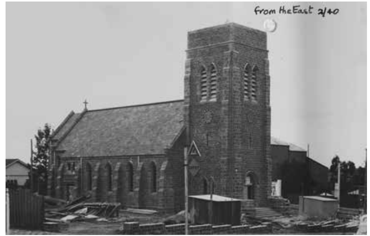
St Andrew's Gardiner under construction 1940 Reg no 8704