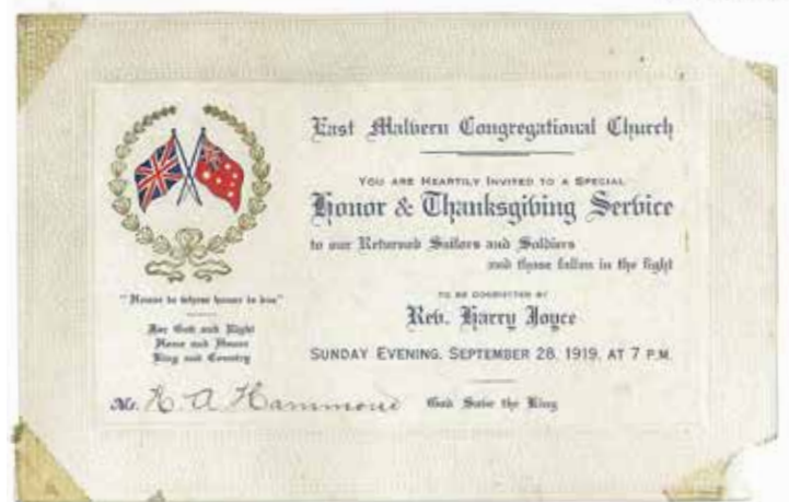
East Malvern Congregational Church invitation 1919