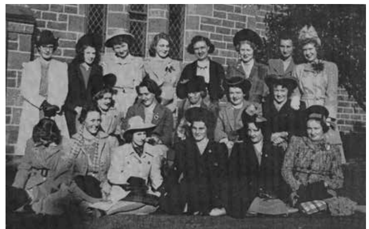
St Andrew's Girls Bible Class 1942 Reg no 8720