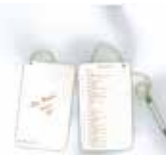
Dance card 'The Kiosk' Malvern 1913

Di Foster recently spotted four items of interest on eBay including an early postcard showing the Malvern Gardens, a 1953 Gardiner Central School Badge, a pint size milk bottle with the words 'This bottle contains milk bottled for sale by C. Coughlan and Son, Gladys Park Dairy, Malvern' (105 Wattletree Road), and an East Malvern Congregational Church invitation to a special 'Honour & Thanksgiving Service' on September 28th 1919.