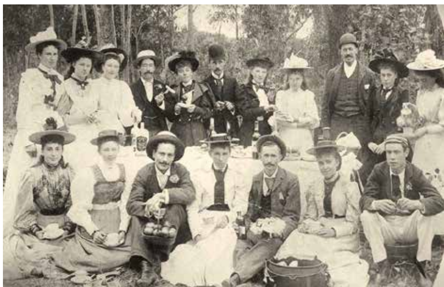
Spring Road School picnic c1900 Reg no 2624