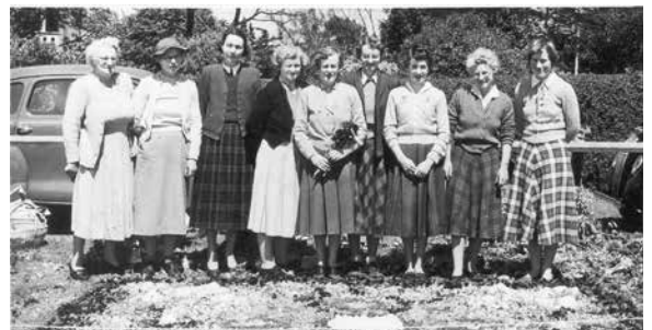
Darling Road Methodist Church at the Floral Carpet Competition 1956 Reg no 6640