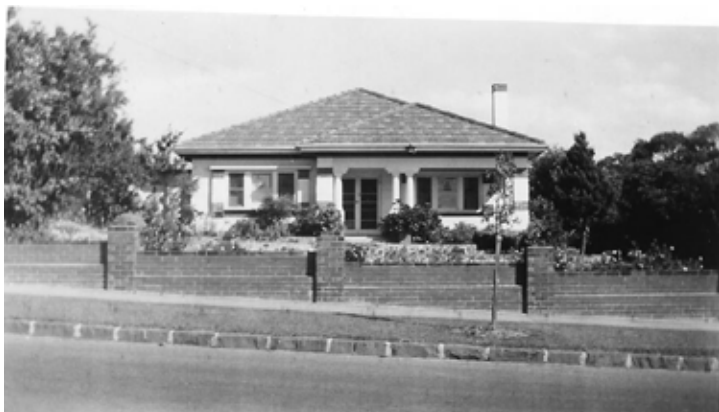
39 Chadstone Road East Malvern (undated)

Susan Anderson has donated scanned copies of material relating to 39 Chadstone Road Malvern. The four page land sale brochure has detail of land for sale in Chadstone Road and the surrounding streets. Susan's parents, Ella and Howard Sergeant, built 39 Chadstone Road c1936.