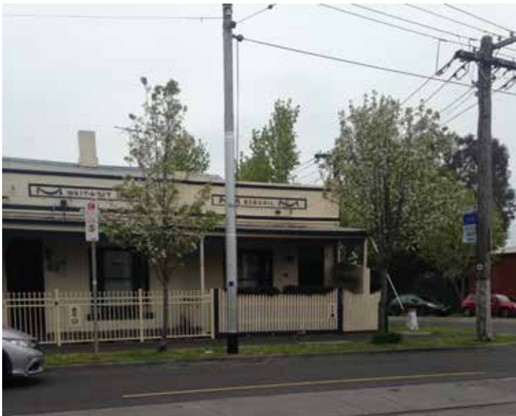
227-233 Wattletree Road Malvern 2016

The SLV has digitised the ledger for the Victoria Turf Club covering 1854-1863, which includes the details of the first Melbourne Cup