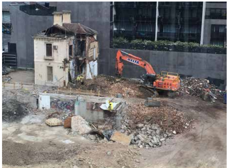
241 Toorak Road South Yarra. Demolished September 2016

The Melbourne Tramway & Omnibus Co rented the property to a succession of short term tenants. Over the following years the property changed ownership many times and continued to be occupied by a long list of tenants. It appears that Prahran Council purchased the property for a time. At one time there was also a two storey office building behind the house but this was demolished in 1993.