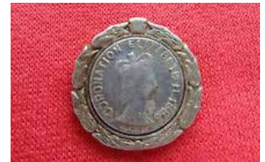
Gardiner Central School Badge 1953