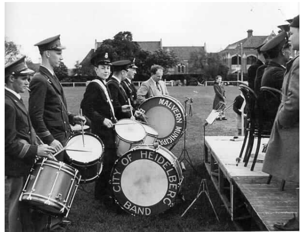
Centenary Massed Bands Malvern Cricket Ground Reg no 731