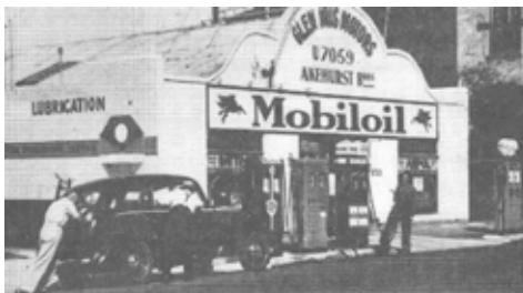
Glen Iris Motors, Malvern Road Glen Iris 1948 Reg No 7755