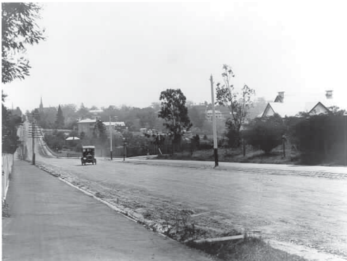
View of Toorak Road Malvern looking west from Glenferrie Road, 1912 Reg no 2234