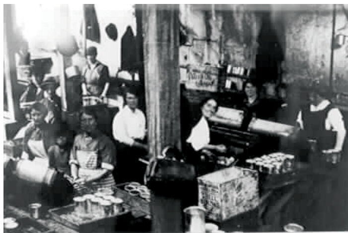
Jam Factory undated Reg No 9081

The Jam Factory operated as a food preserving company for almost one hundred years in Chapel Street, Prahran after the Victoria Brewery (1858-1876), vacated the site. The complex had various names and owners, including the Australasian Jam Company (AJC) and IXL, both owned by the Henry Jones Co-op. At its seasonal peak, the factory employed 500 people, processing about 175 tonnes of fruit per day. In 1972 the Henry Jones Co-op was taken over by Elders (later Elders IXL), who developed a shopping complex that re-used many of the original buildings. In 1979, the Jam Factory Shopping Centre opened, comprising more than fifty speciality shops, including a branch outlet of the prestigious Collins Street department store, Georges. Subsequent redevelopment in the 1990s was led by Village/Roadshow cinemas.