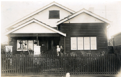
Benmond, 19 McArthur Street Malvern 1923 Reg no 61852