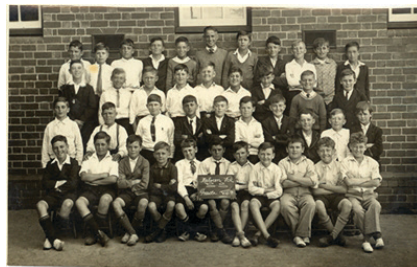
Malvern Road State School: Grade VIIa c1920 Reg no 61855