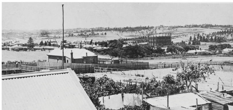
View looking north east from Stanton's Bakery, Malvern Road, Malvern. The gasometer can be seen in Toorak Road Reg No 1266