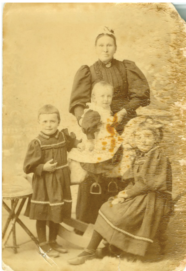
Tevendale children with their grandmother (undated) Reg No 61683