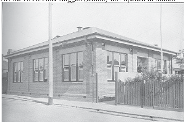
The Hornbrook Free Kindergarten was built on the site of the earlier Ragged School in 1928. Reg no 12748

http://prov.vic.gov.au/publications/provenance/provenance2015/from-squalor-and-vice#sthash.HKdG1K9H.dpuf