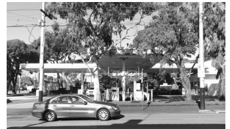
South west corner of Malvern and Glenferrie Roads, Malvern 2015