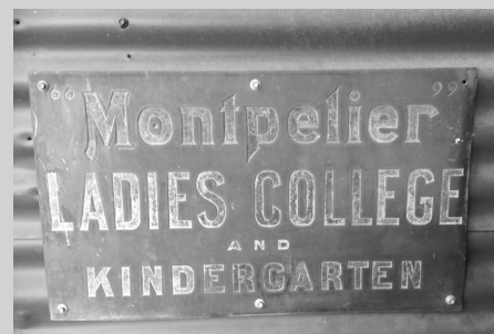
Montpelier Ladies College and Kindergarten (undated)

The lessons given to the Primary class were composition, writing, English, arithmetic, geography, nature study, drawing, History of Empire, music, physical exercise and drill, manual work, French and algebra. The sub-primary children took reading, spelling, writing, recitation, oral and written composition, arithmetic, drawing, physical training and manual work. Kindergarten classes were also held and the school standard was noted on the registration as that required for primary examination. The school had closed by c1920.