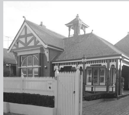
30 McKinley Avenue Malvern 2015