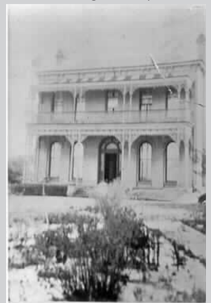
Heatherleigh Waverley Road East Malvern c1925 Reg No 2629