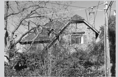
30 Evans Court, Toorak 2015