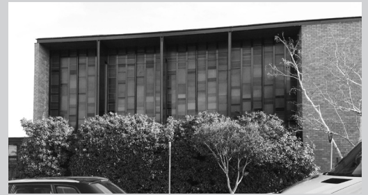
St James Anglican Church Glen Iris 2015