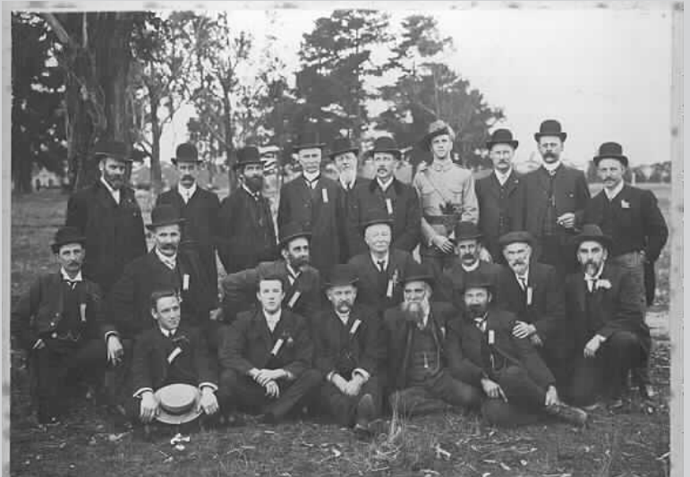
Malvern Board of Advice c1905 Reg No 920