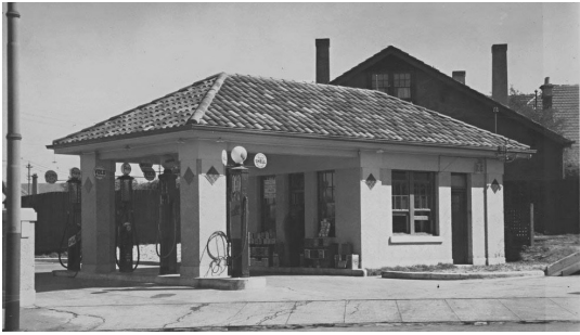
Byrne's Service Station, Glenferrie Road Malvern. Reg No 61740

The Malvern Hill Hotel, on the north-west corner of Malvern and Glenferrie Roads, was for the hamlet of Gardiner, an inn of some importance, with its five parlours, four bedrooms and outside, another two bedrooms. Opposite the hotel, on the south-west corner of Malvern Road, was the local stockyard. It was here that stock, travelling from Gippsland to Melbourne, was yarded. Stockmen's horses were bedded in the six stall stable, while their masters found food and shelter within the hotel.