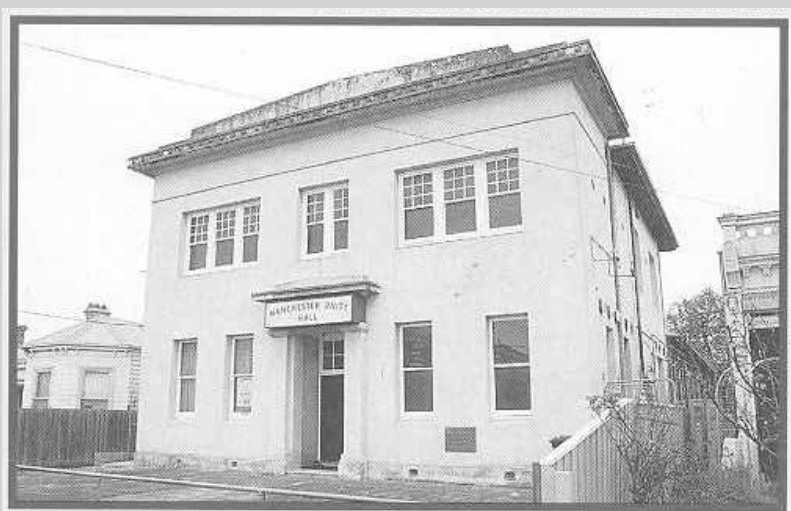
14 Valetta Street Malvern 1996 Reg no 12223