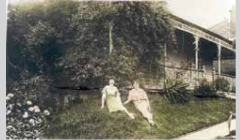
Gertrude Ransom and daughter Marjory, The Olives, Wattletree Road East Malvern c1930 Reg no 6606

Bookings: Lorraine 9885 9082 All welcome!