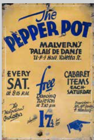
The Pepper Pot Malvern's Palais de Dance, U.F.S. Hall Valetta St (undated) Reg No 13672