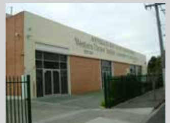
Osborne Street Sth Yarra c2014

The first premises of the Association was in Osborne Street, South Yarra. From 2007 a purpose-built centre in Union Street, Windsor became the home for the Association.