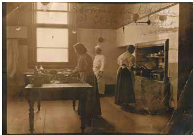
Stonnington kitchen c1906 Reg No 61032

Stonnington , or Stonington , was acquired for the State by the Hogan Administration in 1928, the purchase price being £35,000.'