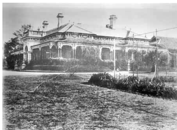
Northbrook 1929 Reg No 5028