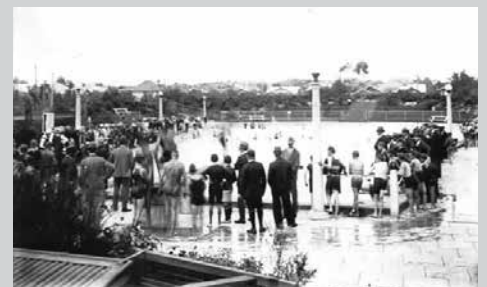
Malvern Baths 1927 Reg No 329

Bookings: Lorraine 9885 9082 All welcome!