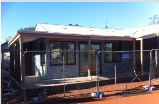
Partly completed new clubhouse for the Glendearg Malvern All Saints Tennis Club 2014