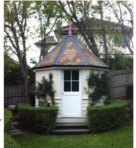
Gazebo, 2-4 Myrnong Crescent Toorak 2014