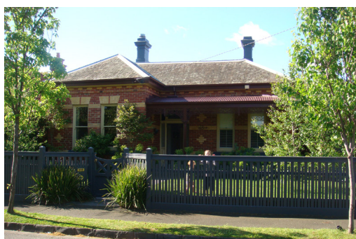
13 Chanak Street Malvern East.