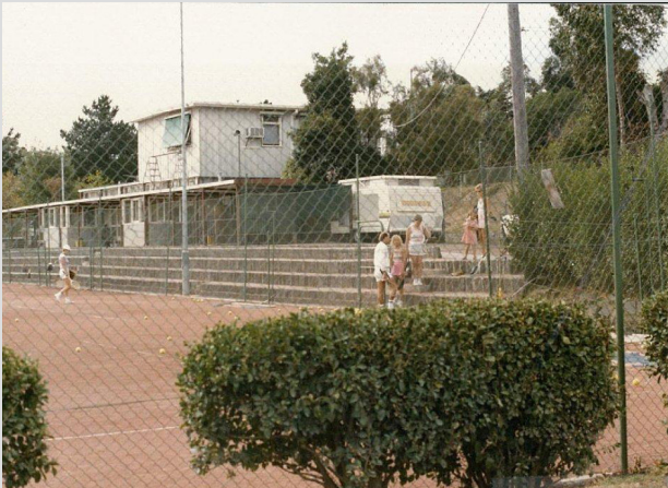
East Malvern Tennis Club c1984 Reg No 61233