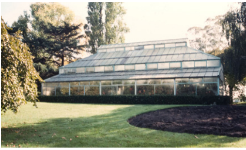
Conservatory Central Park Malvern East c1970s reg No 57262