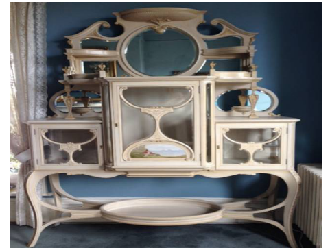
Furniture from Markille's Malvern Hill Hotel