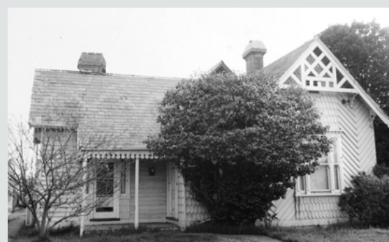
1 Darling Road East Malvern 1974 Reg No 13498

To find out more visit www.stonnington.vic.gov.au/history or 8290 1360. This service costs $250.00 and requires a minimum of 3 months notice.