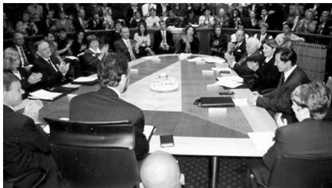
First Stonnington Council Meeting 1996 Reg No 14099