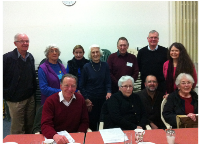
South Metro history group meeting at Malvern 2014