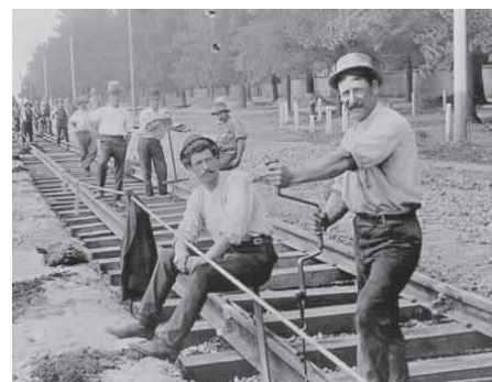
Laying tram tracks, Dandenong Road Armadale 1911 Reg No 1616