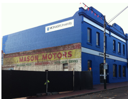
Mason Motors advertisement, 871 Dandenong Road Malvern East 2014