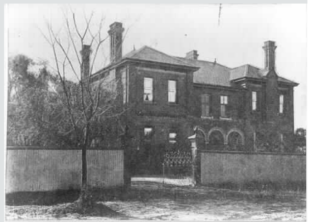
The College of the Bible, Elm Road, Glen Iris c1918 Reg No 1794

The College of the Bible site was purchased by the Road Construction Authority in 1987 and two years later the College relocated due to the construction of the South-Eastern Arterial Road Link. Malvern Council purchased the property from the RCA in 1989 and the following year offered a lease to the Elm Road Artists Group, which was refused. Twenty-six artists were working at Elm Road including painters, sculptors and ceramicists. The property was sold to MECWA in 1993, and all buildings except Glenburn were demolished. Glenburn was destroyed by fire in 1999 and MECWA owned buildings now occupy the site.