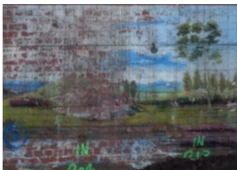
Country scene, Mason Motors advertisement 2014