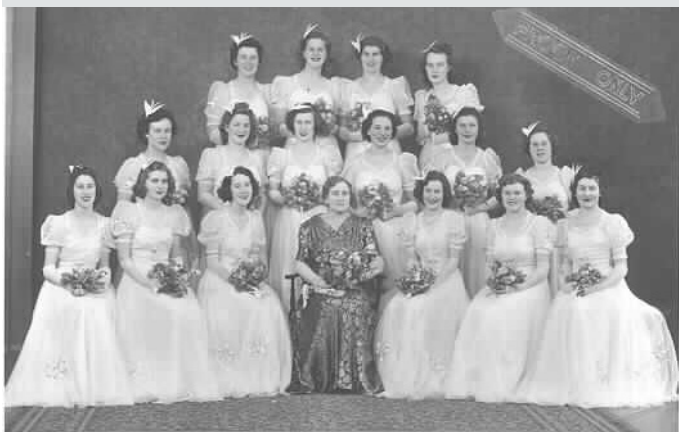
Malvern Mayoral Ball 1941 Reg No 5194