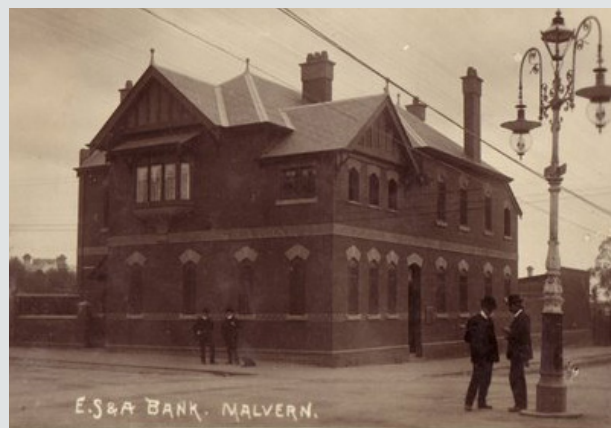
E.S. & A. Bank, corner of High Street and Glenferrie Road, Malvern 1907 Reg No 8061