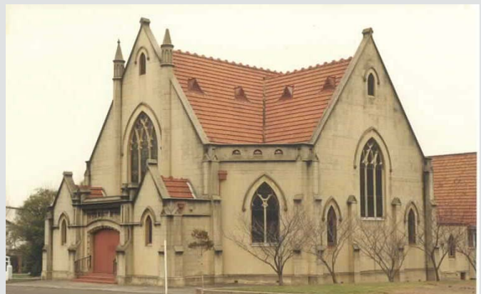
Uniting Church (formally Methodist), Burke Road, Glen Iris c1930 Reg No 6991