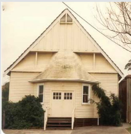
Timber Hall, 1984 Reg No 6992

The first Methodist church service in Glen Iris was held at Belmont (Belmont Ave, Glen Iris) on 19 January 1913. Land for a permanent church was purchased on the north corner of Burke Road and Payne Street, Glen Iris, and cost £461. The first service in the new timber church was held on 17 May 1914. It was proposed to erect a new church in 1919, but due to the shortage of material following WWI, it was decided to just extend the existing building. The foundation stone of the new brick church was laid by Frederick Cato on 3 May 1924. In May 1937 the church was rendered. The church closed in June 1984. It was then demolished and replaced with the aged accommodation, 'Gardiner Retirement Lodge'.