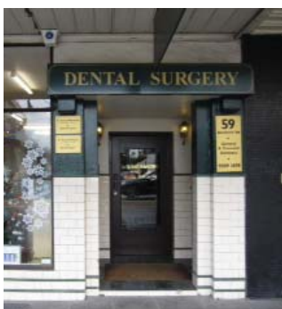
Entrance to 59 Glenferrie Road Malvern 2013