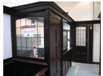
Interior 59 Glenferrie Road Malvern 2013