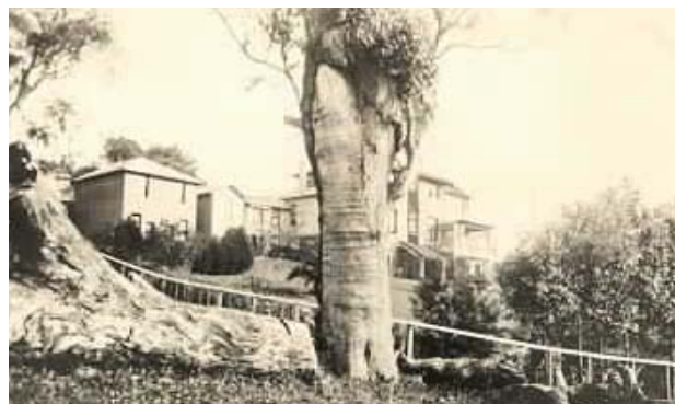
Photo of the rear of Gleneagles , north end of Kooyong Road, Toorak 1939 Reg No 159