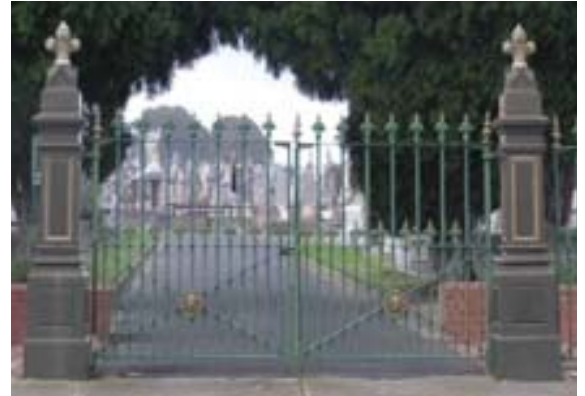
Brighton Cemetery gates c2013