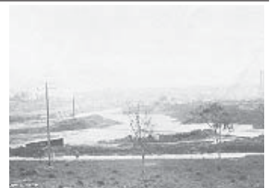
New Yarra River channel, opposite Como Park c1928 Reg No 12757