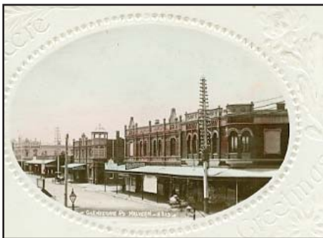
Glenferrie Rd Malvern c1910 Reg No 61020 This photograph, of the east side of Glenferrie Road Malvern, was possibly taken from the railway line.