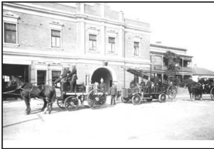
Fire Station, Willis Street Malvern c1910 Reg No 61017