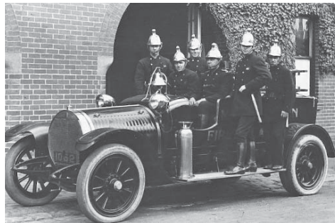
Windsor Fire Station c1900 Reg No 61018