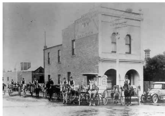
Merriman's Dairy Union Street 1912 Reg No 5620

When you book remember to mention the special price for Malvern Historical Society members!