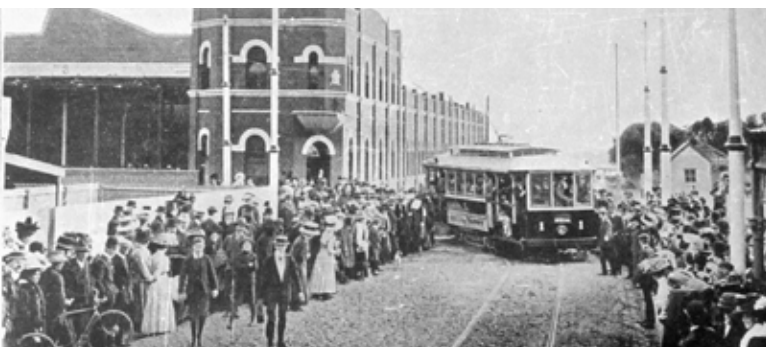
First tram leaving Malvern Tram Depot 1910, 30 May 1910 Reg No 1104

In 1920 the Melbourne and Metropolitan Tramways Board (MMTB) took over the operation of all of Melbourne's tramways from the separate councils. In the mid-1920s the MMTB began to replace all cable trams with electric lines. Cable trams along Chapel Street and Toorak Road were replaced with electric trams in 1927. Melbourne's final cable tram ceased operating in 1940.