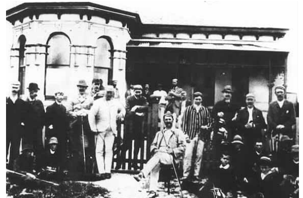
Members of the (Royal) Melbourne Golf Club at East Malvern in 1891. The members are standing in front of the clubhouse in Turner Street. Reg No 168

Development was slow, and was brought to a standstill by the dreadful depression of the early 1890s. Quick to take advantage of the hiatus was the Melbourne Golf Club, later the Royal Melbourne Golf Club. Much of the land was taken over for a golf course in June 1891, the contractors Finlay & Conacher having laid out the links in a matter of weeks. A clubhouse was established in an unoccupied Italianate villa at 16 Turner Street and another empty house across the street was used by the associates and caddies. When the Royal Melbourne Golf Club removed to its present home at Sandringham in 1901, the course was taken over by Caulfield (later Metropolitan) Golf Club, but the course was abandoned to domestic development when that Club also moved on in 1907.