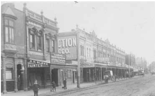
Glenferrie Road Malvern c1907 Reg No 60716