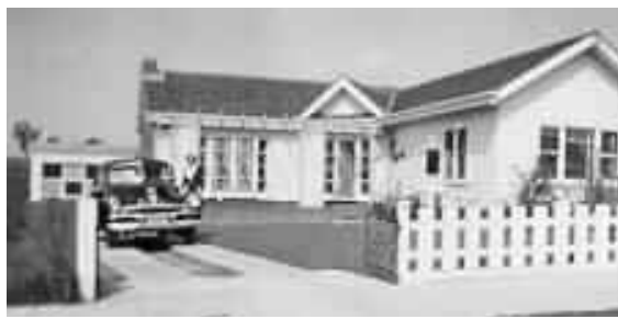
12 Chapman Street East Malvern 1955 Reg No 1009

During the past few months the Society and the Stonnington History Centre have received enquiries relating to St Andrew's Gardiner Cricket Club which was formed in 1916, plaques on historic sites in our area and from a staff member at La Trobe University, who is creating an Australia-wide book to commemorate the centenary of WWI.