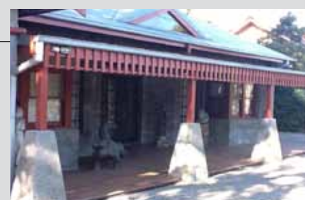
Duldig Studio 2012