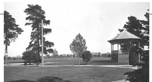
Bandstand in Central Park East Malvern c1920 Reg No 1212

Please call Lorraine Sage, President, 9885 9082.