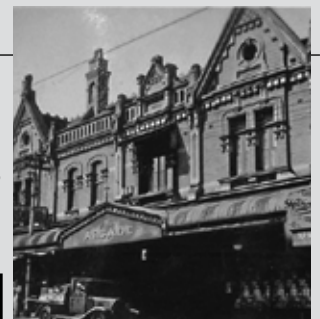
Kings Arcade, Armadale c 1942 Reg No 60680