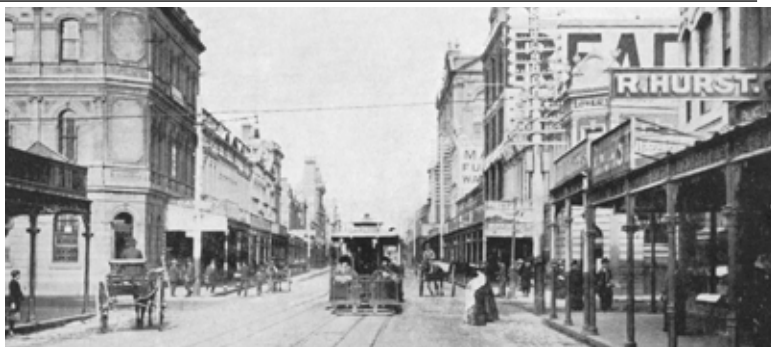
Chapel Street, looking south past Malvern Road, c1905 Reg No 2276.1

A short video of the Malvern Tram Depot opening can be seen on the Australian Screen website at www.aso.gov.au . Photographs and more information can be found on the Stonnington History Centre's website at www.stonnington.vic.gov.au .