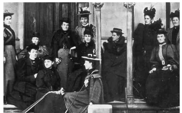
Associates at Royal Melbourne Golf Club in front of the clubhouse in Turner Street, East Malvern c1892. Reg No 183