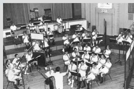
A.B.C. Studio Waverley Theatre East Malvern 1976 Reg No 5166

We are always looking for material relating to this and other periods. Scanning of the photos can be arranged. Just call the Stonnington History Centre 8290 1360.