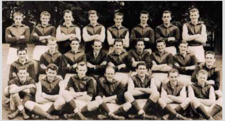
East Malvern 'A' Grade Premiers, 1959

This is the story of a truly remarkable football club inaugurated in 1934 by a group local businessmen & identities, managed over the years by a succession of dedicated administrators, enjoying unparalleled success then finally succumbing to the lack of sufficient local & municipal interest when confronted with an aging local population & the growing professionalism of modern Australian game.