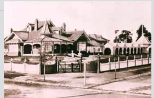
Residence of Oliver Gilpin 1911 Reg No. 7579

East Malvern Community Bank Meeting Room 300 Waverley Road East Malvern (close to the No. 3 tram terminus) Gold coin donation RSVP Lorraine 9885 9082