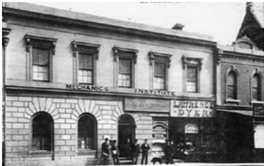
Prahran Mechanics' Institute in Chapel Street 1900 Reg No. 8545

The PMI, in line with its objective to encourage and facilitate historical research, invites you to participate in the 2012 Short History Prize competition. Historical essays, articles or work on a place or aspect of a place in Victoria or a person associated with a place in Victoria, written by a member or members of a Victorian historical society or similar organisation are sought.