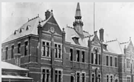
Prahran State School 1906 Reg No. 7228

"The Queen's visit in 1954 reminded me of the highlight of my primary school days at Prahran State School. Some of the students in the junior classes danced for the Queen in a display on the MCG. The segment in which I took part was a story, read on the loudspeaker system across the MCG, about toys in the nursery or toyshop who came to life at night. I danced as a fairy and there were also toy soldiers, golliwogs and teddies, I think.