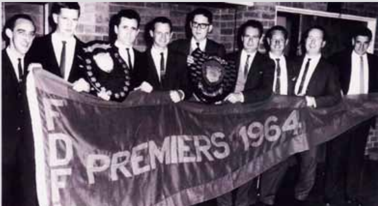
East Malvern Premiers, 1964

Tom Hafey's football career gets special mention: he played his first games with the club in 1948, and played with the Juniors until 1950, then the Senior Eighteen in 1951 and 1952 when he won the Best & Fairest in the Caulfield Oakleigh District League. He was cleared to Richmond in 1953, but returned to play several games in 1959, including the Grand Final in which East Malvern defeated Glen Waverley at the Oakleigh Football Ground. Tom continued an active association with the club throughout the sixties by introducing many players firstly from the Shepparton area where he was coaching, then later fringe players from Richmond.