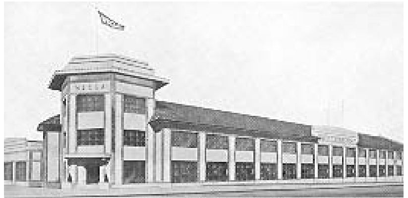
Hecla Works Chapel Street North, on the east side of Chapel Street, north of Toorak Road 1927 Reg No 12707