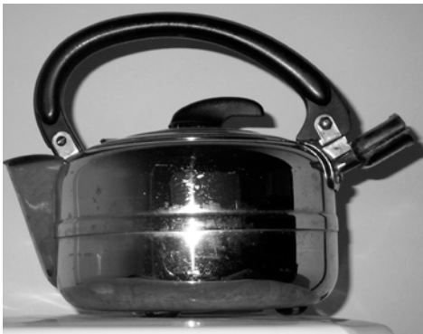
Hecla High-Speed Kettle, c.1950s