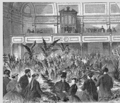
Prahran Town Hall organ 1867