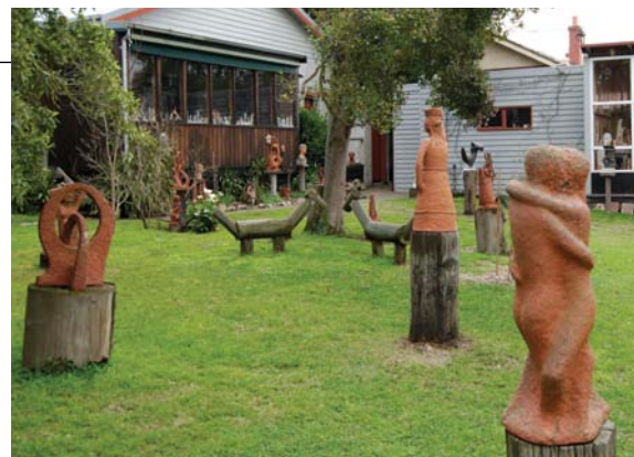
Duldig Studio, East Malvern