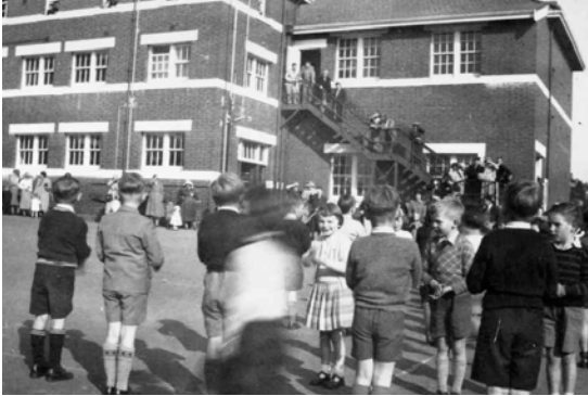
Gardiner State School Education Day folk dancing c1955 Reg No 60277