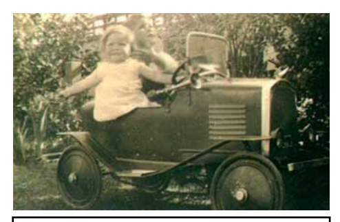
Ron and Wilma Syle at 8 Winton Road, East Malvern 1935 Reg No 60062