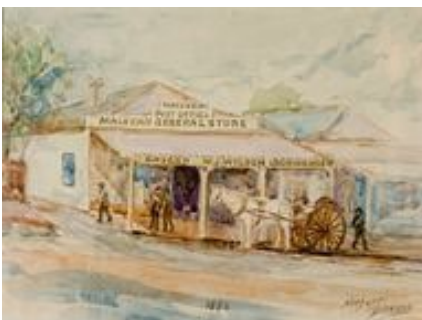
Framed watercolour of Malvern Post Office and Malvern General Store Reg No MP15279

"The Malvern Post Office was situated near the corner of Elizabeth Street and Malvern Road . It was in an old building and seventy years ago it was the only Post Office in the district. It was also a store, with a butcher's shop next door. In the centre of the village there was a brick-yard at the corner of Spring Road ; the Methodist Church was at the other end of Elizabeth Street which was removed to Spring Road in 1886.