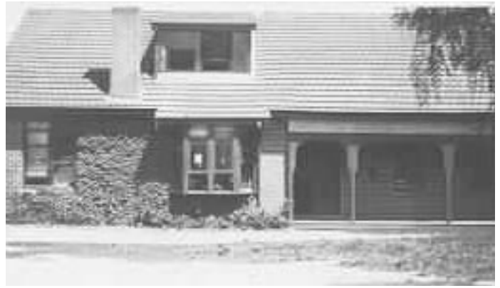
Aldworth Girls' Grammar School 1914, corner of Coppin and Clarence Streets Reg No 421