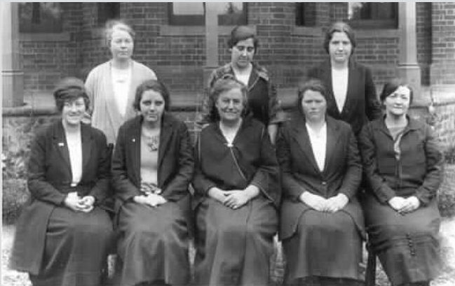
Female staff at the College of the Bible c 1925 Reg No MP1820