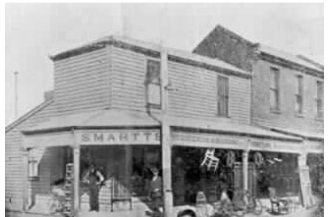
Photograph from the Prahran Jubilee History c1906 Reg No PH7375