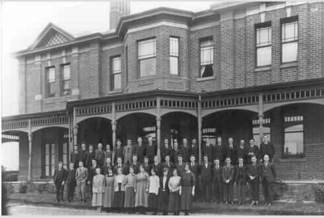
Students at the College of the Bible c1912 Reg No MP1783