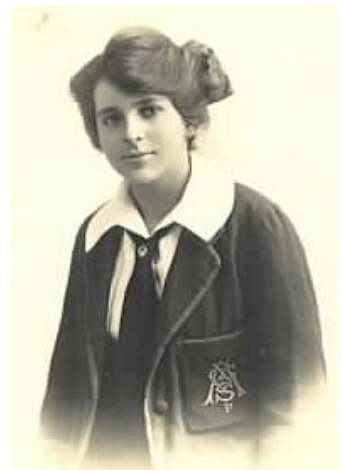
Aldworth Girls' Grammar School student. c1918 Reg No MP398