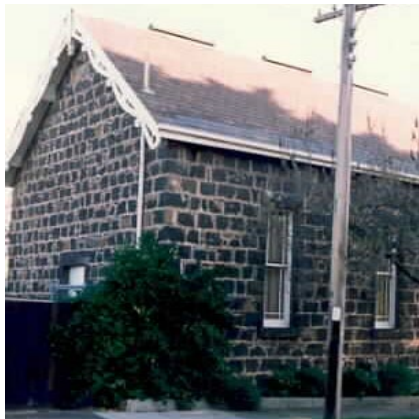
Bluestone chapel, 19 Mayfield Avenue, Malvern 1992. Reg No MP9000

The new book will be available at the Launch for the special price of $5