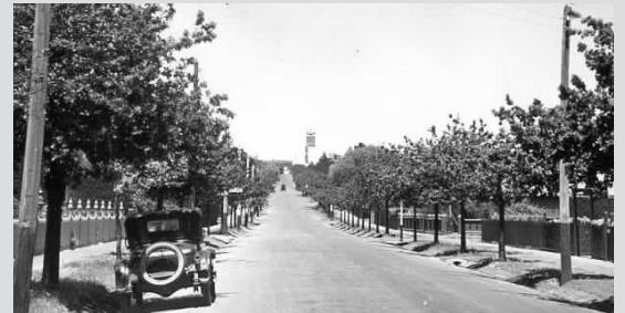
Finch Street Malvern East c1940 Reg No MP4505

(Don't forget to read all parking signs carefully)