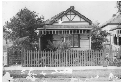
37 Ardrie Road, Malvern East 1929