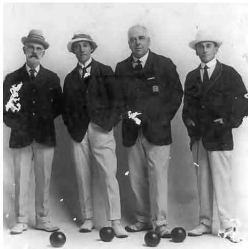
Malvern Bowling Club, Coonil Crescent Reg No MP382