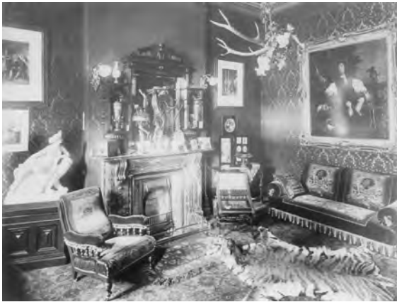
Morning Room, Gotha