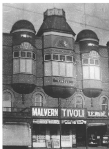
Tivoli Theatre Glenferrie Rd Malvern