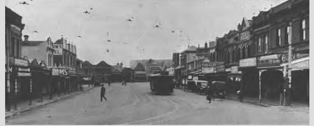
Derby Road, Caulfield looking north towards Dandenong Road 1923 Reg No MP711