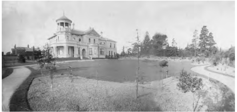
Gotha 24 Kensington Road, South Yarra

These interior shots do not reproduce well in a photocopied newsletter, but readers will be able to examine them online when they are catalogued to our database - www.stonnington.vic.gov.au/history Just search the keyword Wertheim .