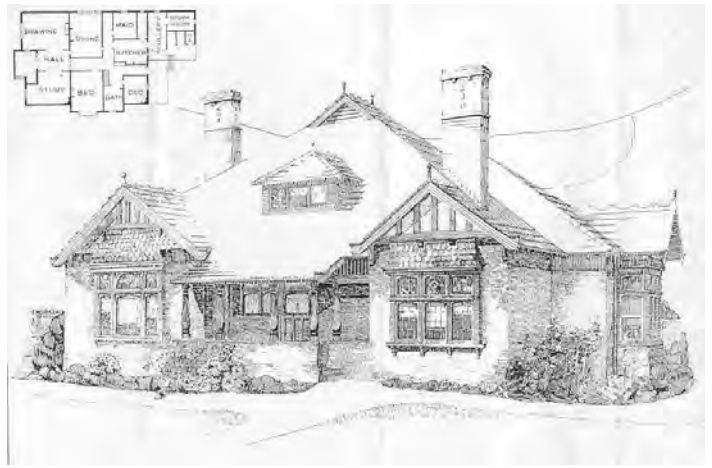
Perspective sketch of villa, in Coonil Crescent Malvern. Edwin Ruck 1914. Reg No MP15010