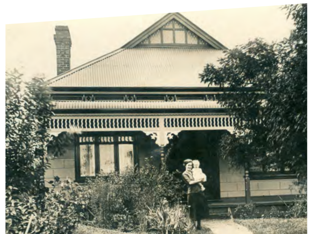
96 Emo Road Malvern East c1924