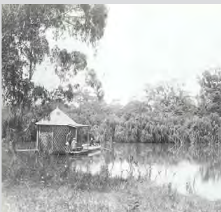
Lake and pavilion, Hedgeley Dene Farm c1880 Reg No MP7344.