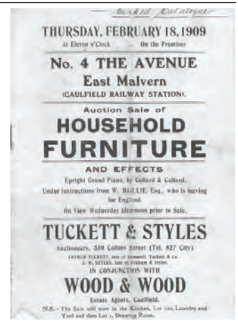
Sale catalogue 4 the Avenue East Malvern 1909 Reg No MP57249

• Dissenters All! – The story of the non-conformist churches of the Malverns England donated by the author Rod Ellis