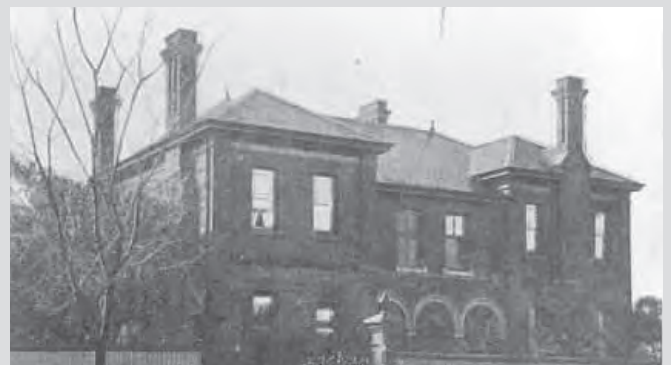
College of the Bible, Glen Iris c1918. Reg No MP1794.