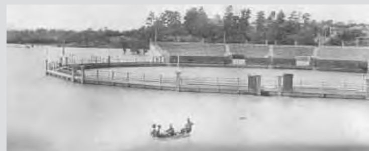
Flood waters at the Stadium Courts at Kooyong December 1934. Reg No MP620.

Kooyong began its long association with the Australian Championships in 1927, hosting the event on thirty-four occasions until 1987, during which time a succession of international players graced its courts. Kooyong was also the venue for five challenge rounds and two final rounds of the Davis Cup from 1946 to 1986. In 1988 the LTAV changed its name to Kooyong Lawn Tennis Club .