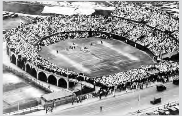
Aerial view of Kooyong LTAV 1934 Reg No MP1341.

The reinforced concrete stand, designed by engineer James Knox, originally provided 5,500 seats and was opened in 1927 by (Sir) Norman Brookes , Australia's first Wimbledon champion. The northern stand extension was constructed in 1934, just prior to massive floods, which submerged the original stand.