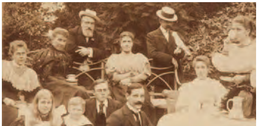
Undated photo of the Lewis Family.