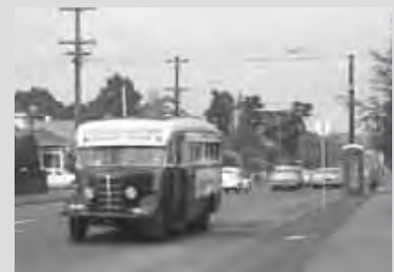
Gardiner to Chadstone bus, 1960. Reg No MP5291.