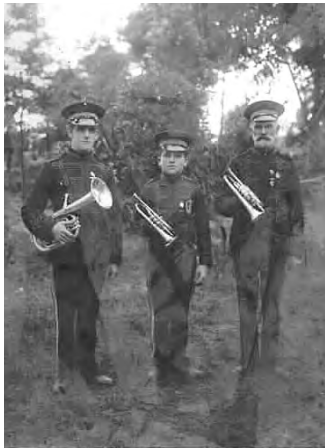
Alway Family Bandsmen 1912. Reg No MP735.