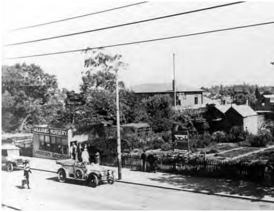
Williams Nursery, south corner of Glenferrie Road and Barkly Avenue 1922. Reg No MP2657.

"I was born in the front bedroom of a house in Barkly Avenue, Malvern on 10.1.1908 and am now 72 years... I remember when peace was declared in 1919, I was 11 years old at the time and everybody went mad that night. They marched abreast the full width of Glenferrie Road , seeing how much noise they could make. There were single track trams there at that time and one came along trying to get through the crowd but about 100 people pulled the pole off the wire and rocked the tram until it was derailed. The steel poles holding the overhead wire for the trams were all in the centre of the road.