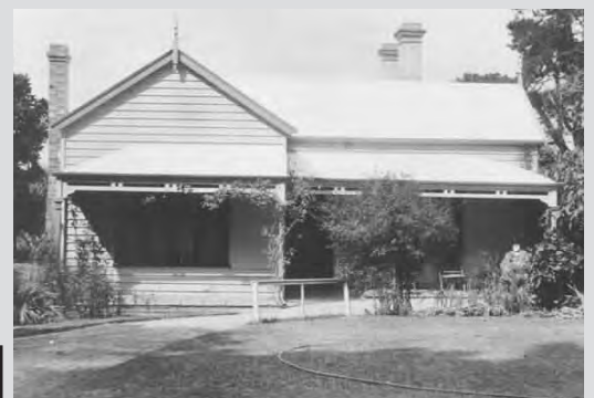
Fulbourne, 200-202 Wattletree Malvern c1900 Reg No MP 2310.