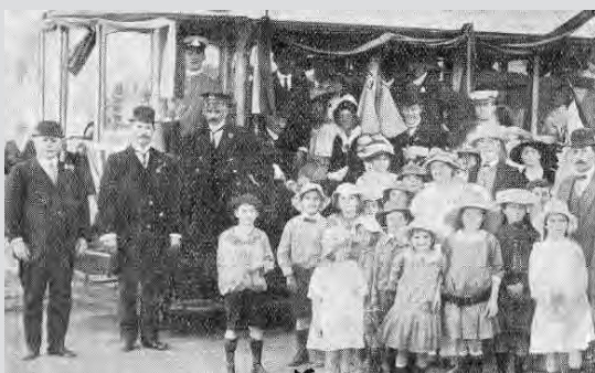
Arrival of official tram at Burke Road Gardiner April 1915 Reg No. MP14456.

We hope others will share also their memories of our local area for all to enjoy.