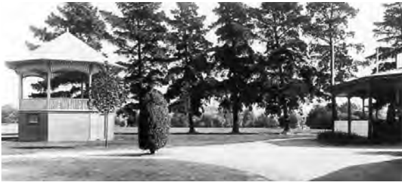
Bandstand, Central Park East Malvern 1923 Reg No MP2600.