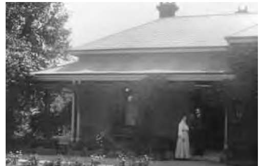
Llaneast, Glenferrie Road 1903. Reg No MP2626.