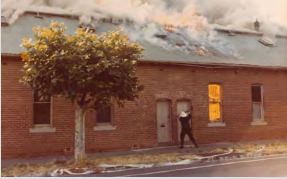
Fire at the Belson Street warehouses. 1973 Reg No 13502