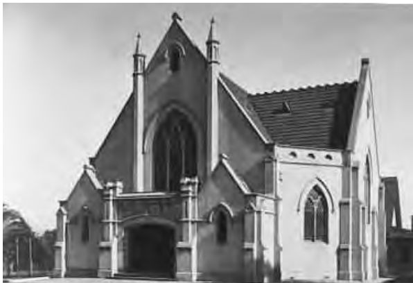
Methodist Church Burke Road Glen Iris c 1965. Reg No M1100