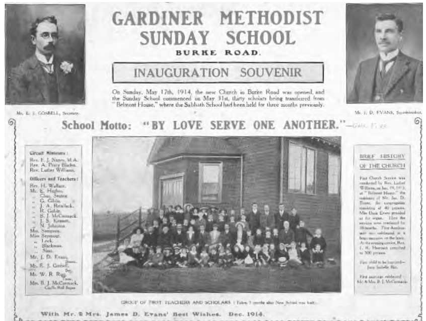
Gardiner Methodist Sunday School, 1914 Reg No M57173