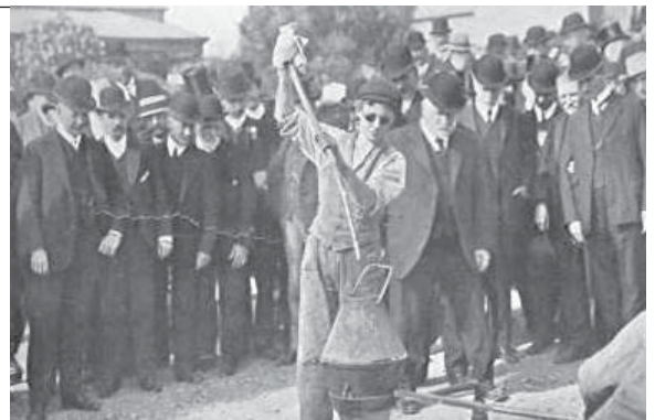
Prahran Mayor Naylor laying the first rail in High Street, near Ivy Street 20 Oct 1909 Reg No 9112

Lines opened in 1913 included to St Kilda Beach , from Malvern Town Hall to Cotham Road Kew , Balaclava Junction to Darling Road , Balaclava Junction (Caulfield) , to Brighton Road , and Hawthorn Road to Grange Road , Glenhuntly via Glenhuntly Road . A 'grand union' junction was installed at Balaclava Junction . (A 'grand union' junction features