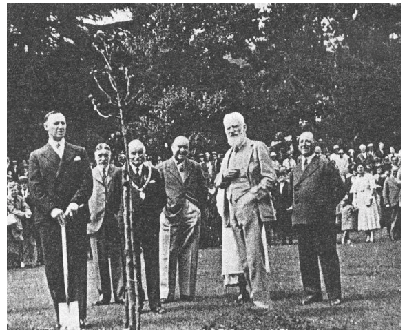
Tree planting ceremony by Mr G. Bernard Shaw, Malvern [England] Festival, 1936 Reg No 12379

For more information and photographs of the mulberry tree at the entrance to Northbrook , the Stonnington Heritage Centre , click on www.stonnington.vic.gov/history and keyword mulberry tree and Northbrook .