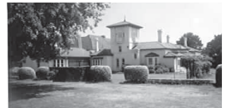
Umina , CWA (undated) Reg No 2482

R.S.V.P. - Lorraine 9885 9082 no later than Thursday 5 November.