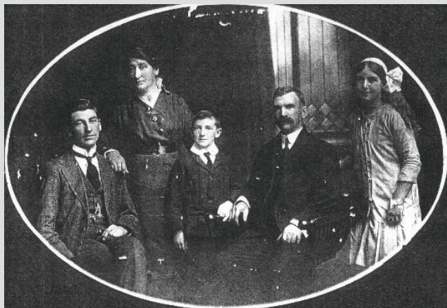
Untitled photograph from Hunt family album