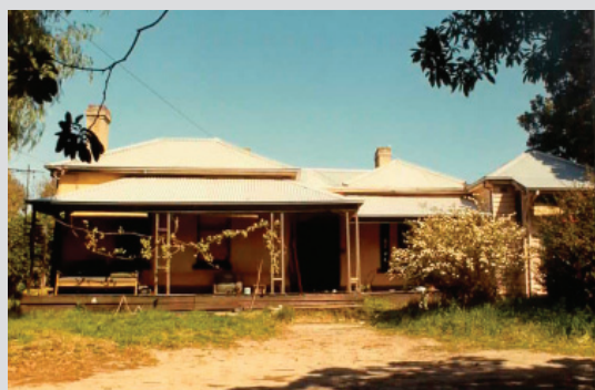
Langleas 66 Wattletree Road Armadale c1980 Reg No 5213