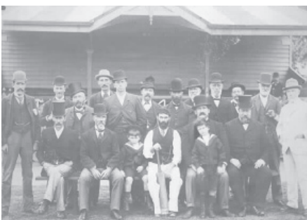
Group of Malvern Councillors and Officers, municipal cricket match 1894 Reg No 1060