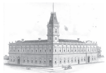
Proposed Malvern Shire Hall, 1885 Reg No 1119