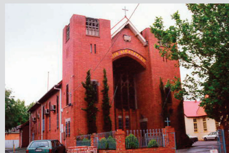
St Catherine's Greek Orthodox Church (Former Peace Memorial Methodist Church), Epping Street East Malvern 1994