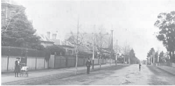
Wattle Tree Road c1900 Reg No 1244