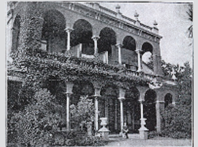
Garden House, Valentine Grove, Armadale 1924 Reg No 11115