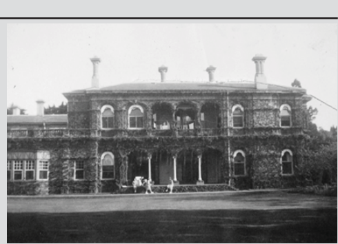
Heathfield, Kooyong Road 1944 Reg No12515

An enquiry was also received from a gentleman who lived at Heathfield, Kooyong Road Toorak after his father had been appointed as Deputy Manager at the Royal Childrens' Hospital. He believes the house was used as night nurses' accommodation and accordingly one had to remain quiet for fear of disturbing the sleeping nurses! The family was initially housed on the ground floor in the billiard room which in fact was large enough to be divided up by curtains into about 4 rooms. There were also several large cork oak trees from which one could harvest large pieces of cork.