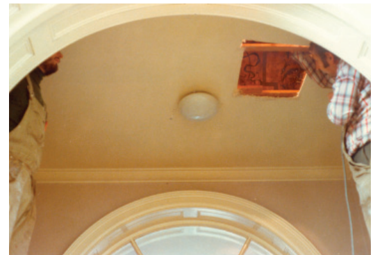
Northbrook's ornate ceiling revealed 1980's