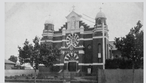
St Joseph's Malvern 1908 Reg No. 9703