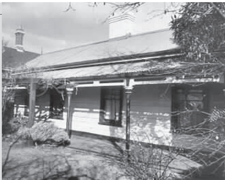
Former Wattle Tree Hotel c1970 Reg No. 6519

The National Trust of Australia (Victoria) describes Glendearg as ...a building of simple forms, with timber verandah and restrained colonial details, is of architectural interest as an early hotel which survives to illustrate the vernacular building traditions of early Melbourne. The meticulously maintained wayside inn is of local historical importance being the oldest surviving intact building in Malvern and closely connected with the social history and physical development of that suburb.