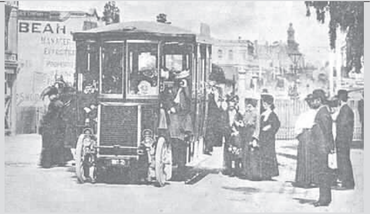
Motor Service at the first section, Armadale Gates 1905 Reg No. 1252

The service was abandoned about the middle of June 1906 as the novelty of motor transport had worn off for the local residents and its irregularity had resulted in the diversion of patrons to the comparatively reliable competing horse-drawn vehicles. For the seven months the buses were in service, they carried a monthly average of 56,000 passengers. The photo, taken in December 1905, shows a steam bus stopped at the level crossing in High Street Armadale. The shops in High Street and the Malvern Town Hall clock tower can be seen in the distance.