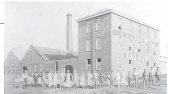
Cawkwell's Tile Works c1900 Reg No 1450

For further information, please call Jane on 0438 515 631