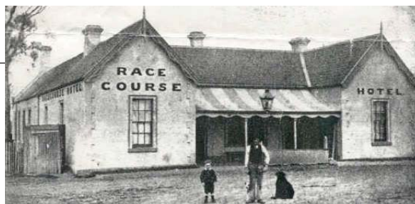
Racecourse Hotel c1885 Reg No. 8220