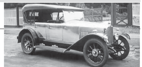
Martin and King car 1947

The Malvern Historical Society is very pleased to announce that we have received a City of Stonnington Community grant to cover the cost of promotional material for the coming year, Discovering Stonnington by Bus 2009 and the use of Council venues for four meetings. The Society appreciates the ongoing support from Stonnington Council.