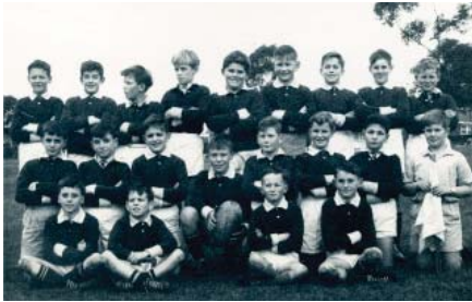
Gardiner Central School Football Team 1963.