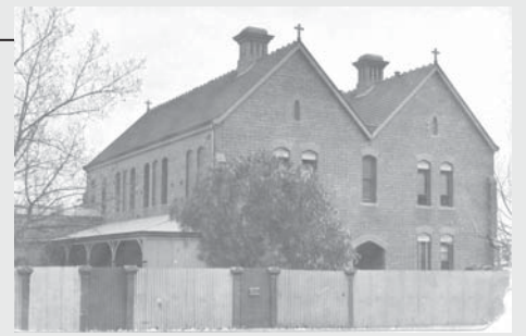
Convent of the Sacred Heart, High Street, Malvern. Postcard c.1910