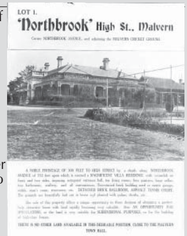
Sale notice Northbrook, High Street., Malvern 1929 Reg No. 357