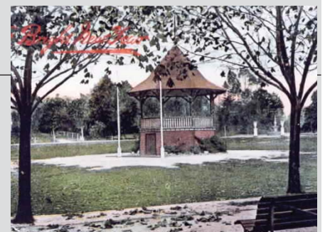
Victoria Gardens, Prahran 1910 Reg No. 2457