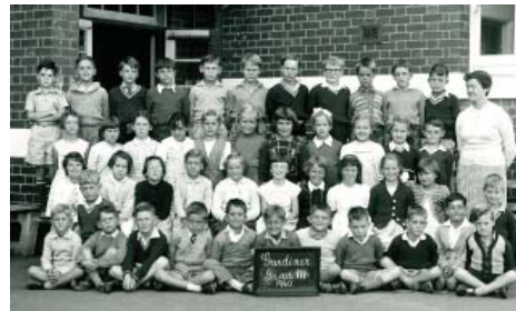
Gardiner Central School Grade 3 1960