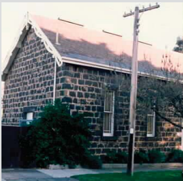
Bluestone chapel, 11 Mayfield Avenue 1992 Reg No. 9000