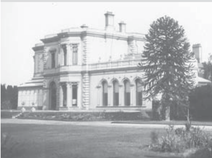
Lisbuoy 5 Irving Road, Toorak. 1923 Reg No 12272