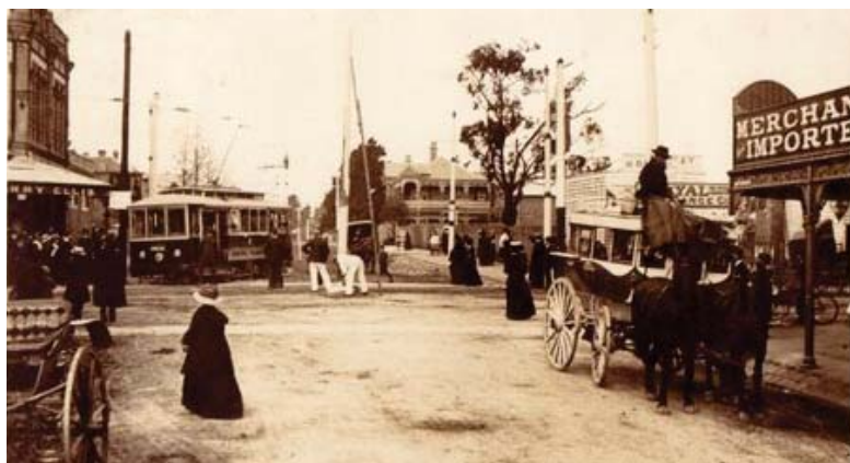
Malvern postcard c 1910 Reg No 9799

"The Salvation Army Soldiers of the Cross 1900-2000" ( Centenary of the first screening of Soldiers of the Cross ) . In 1899 the Salvation Army film, Soldiers of the Cross , was made on the tennis courts at Belgrave on the corner of Dandenong and Belgrave Roads in East Malvern The film is thought to be the first use of motion-picture film for narrative drama.