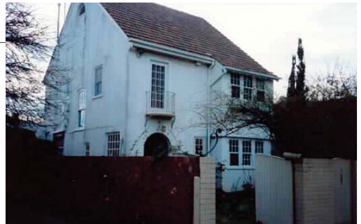
7 Stonnington Place 1992 Reg no 9001