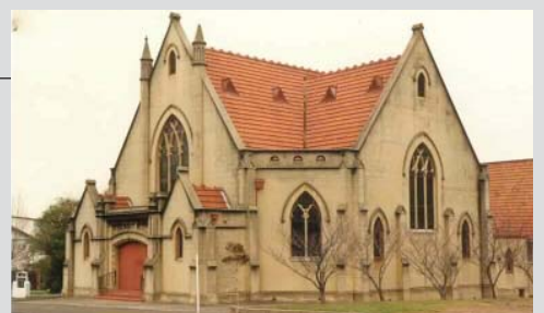
Burke Road Uniting Church, corner of Payne Street, Glen Iris. 1984 Reg no 6991

For further information, please call Steve on 0418 546 103