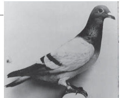
Roma, champion racing pigeon owned by Edward Staples of 931 High Street, Armadale. c1910 Reg No 8544

To find out more and to help us out on the day please call Jane on 0438 515 631