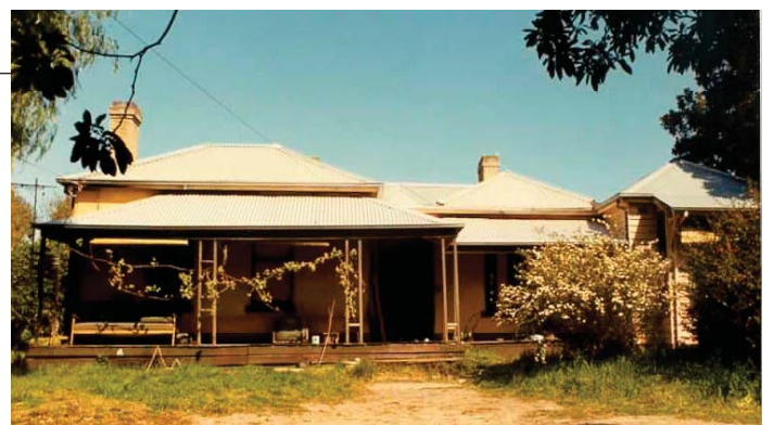
66 Wattletree Road Armadale c 1980 Reg no 5213

The Victorian Heritage Council has recently published the second edition of "What House Is That? A Guide to Victorian Housing Styles". The booklet is intended to inspire interest in Victoria's domestic architecture and help home owners to sensitively restore heritage houses of all eras. It includes design notes, colour swatches and illustrations explaining home styles from Victorian and Edwardian to Bungalow and Modern. Free copies of the booklet are available from Information Victoria , 505 Little Collins Street, Melbourne or 1300366 356 (local call cost). You can also download a copy from www.heritage.vic.gov.au or www.stonnington.vic.gov.au/history