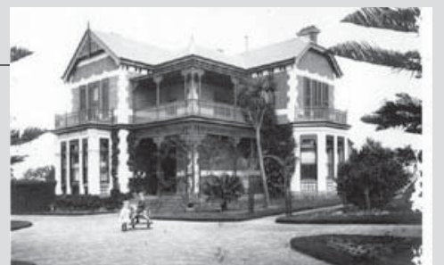
Dimoia, Wattletree Road, East Malvern c1920 Reg no 2486

For further information, please call Steve on 0418 546 103