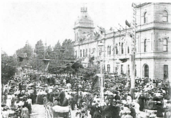
Arrival of the State Governor, Sir George Sydenham Clarke, at the Malvern Town Hall, 1901 Reg No: 1175