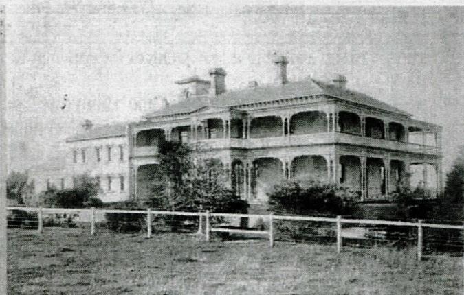
Glenbervie c1890 Reg No: 1347