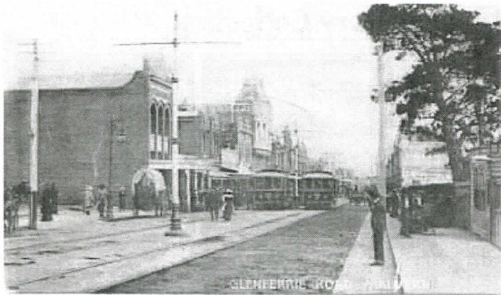
View looking south along Glenferrie Road. The corner of Edsall Street, close to the Cr Holme's ironmongery. c1910 Reg No: 1258

Wikipedia describes vesta cases or vesta boxes as small portable boxes with snap shut covers to contain vestas (short matches) and keep them dry. So called after the name of one of the early makers, they came into use around the 1830s and were produced extensively between 1890 and 1920.