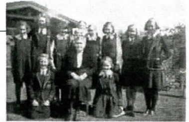
Class IV A Warwick School, Finch Street 1940 Reg No: 1057