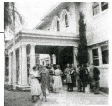
Under the portico after Graduation 1953

They include photos of outdoor assemblies, assemblies at Gardiner Theatre, college sports, excursions, graduations, staff and students. Detailed photos of Glenbervie's interior, exterior and gardens also feature.