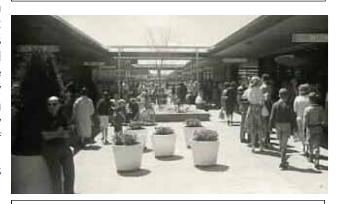
The Mall, Chadstone Shopping Centre (Rose Series) c1960. Reg no 825