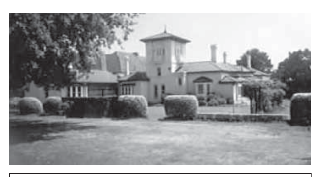
Umina, 13 Lansell Road, Toorak, Country Women's Association. (Rose Series) Undated. Reg no 2482