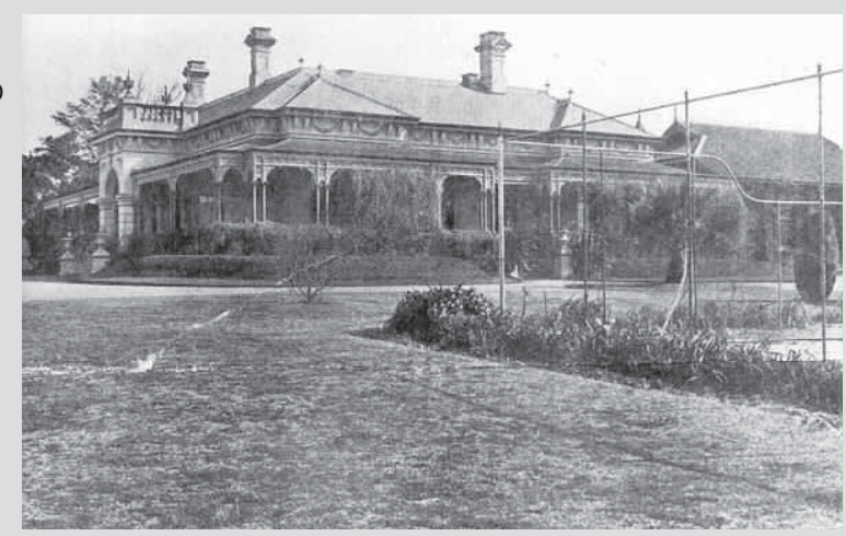
Northbrook High Street Malvern 1929 Reg No 358

The Malvern Historical Society welcomes Council's decision and looks forward to continuing our excellent working relationship with the Stonnington Local History Service.