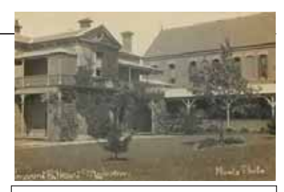
Clifton and Convent of the Sacred Heart, High Street Malvern c.1900 (later Brigidine Convent and Kildara College) Reg No 45