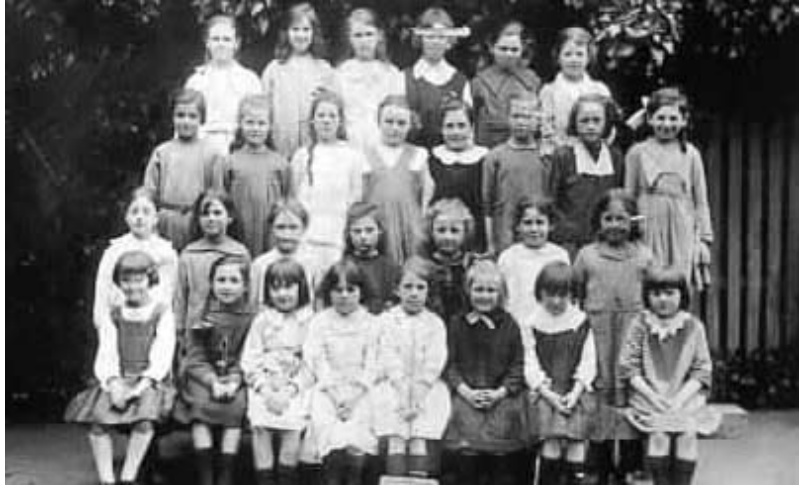
Grades 3 and 4 St Joseph's Primary School 1910 Reg No: 256