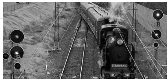
Steam Train, Darling Station