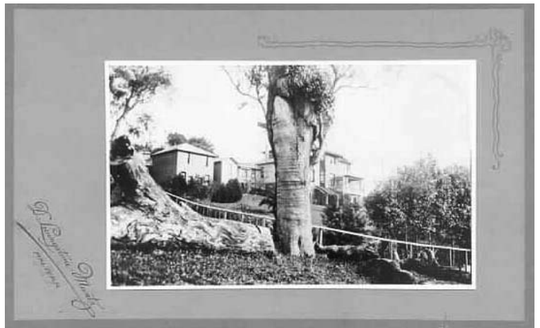
Gleneagles Kooyong Road Toorak 1939 Reg No: 256

Very quickly the indigenous people faced huge difficulties in maintaining their traditional cultures after exposure to white people's practices. This report covers very important issues in a clear systematic way. Of particular relevance is its very detailed bibliography which will enable students and others to further evaluate this very important area of historical analysis. It demonstrates that dire consequences often occur from adoption of poorly thought through policies even if well intentioned. This is an excellent work of interest and relevance to anybody involved or concerned with indigenous and white issues. Many of the observations in this work are still relevant for today's problems. I commend this report to all students of and others interested in Australian history particularly its indigenous aspects. Peter Frawley July 2007