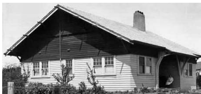
The caretaker's cottage in Ardrrie Park c1920 Reg No: 279

Ewing Tennis Club was established in Waverley Road East Malvern in 1906. New courts were constructed on the site of the original Presbyterian Church (1891-1906), on the eastern side of the entrance to Ardrrie Park. In 1964 the Waverley Road site was sold and redeveloped. New tennis courts were constructed for Ewing Church in Ardrrie Park and the original tennis pavilion was relocated next to the courts. The St John's Tennis Club was established some time prior to 1956 and it is thought that the club has been at Ardrrie Park since that time. In 1997 the tennis clubs of St John's Church and Ewing Memorial Church amalgamated to form the Ardrie Park Combined Churches Tennis Club . Information is needed about the early days of both Ewing Tennis Club and St John's Tennis Club particularly with regard to the clubs' establishment.