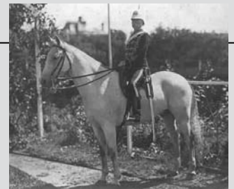
Aide de Camp, Stonington c1920 Ref No: 921

Members- gold coin Non-members $5 RSVP call Roxanne 9885 7194