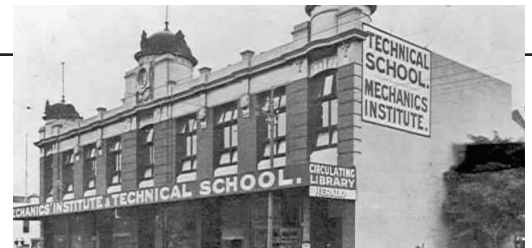
Prahran Technical School, High Street 1927 Ref: 7842

Design for Living, A History of Prahran Tech will be the guest speaker.