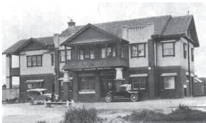
Turf Club Hotel Dandenong Road East Malvern 1923 Ref: 1134