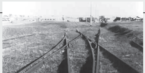
Remains of Waverley Road Station, East Malvern 1940 (now part of the Urban Forest). Ref: 5239