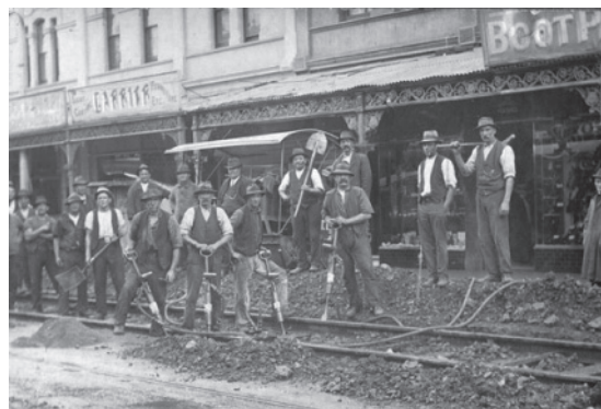
79-87 Glenferrie Road.c1909 (west side, close to Wattletree Road) Ref: 12032