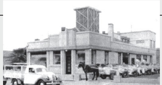
Coughlin's Dairy, Wattletree Road c1930's Ref: 10673

Members- gold coin Non members $5 RSVP Roxanne 98857194