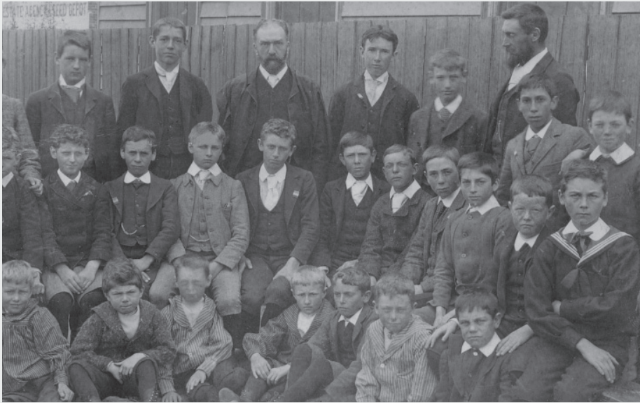
Malvern Boys' College c 1892 Ref: 2738