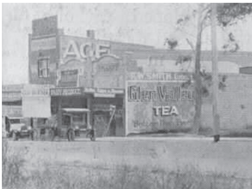
Waverley Road, East Malvern 1929 Ref: 228

Older advertisements still exist on the facades of mainly commercial buildings in Stonnington. The MHS would like to record these advertisements before buildings are demolished or signs painted over.