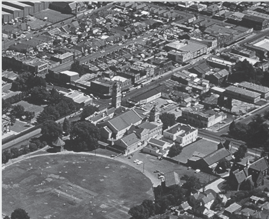
Corner of High Street and Glenferrie Road looking south west 1960's

The corner of Glenferrie Road and High Street was occupied by the Tradesman's Club from 1900 to 1922. The Club was renamed the Malvern Club in 1918. In 1924 eleven shops, designed by prominent architect Walter Burley Griffin, were built with frontages to High Street. They were later demolished. By 1971 Malvern Council had acquired most of the land and a city square was established.