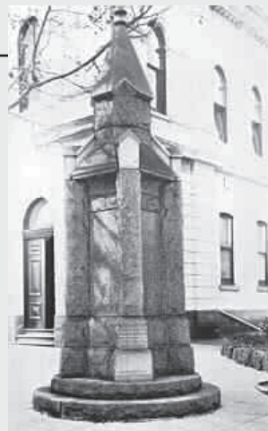
War Memorial outside the Malvern Town Hall c 1935 Ref: 144