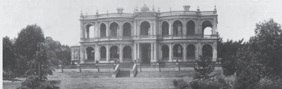
Mandeville Hall 1885 Ref: 2088

Cost $30 (Concession $20) includes booklet, guided tour and afternoon tea