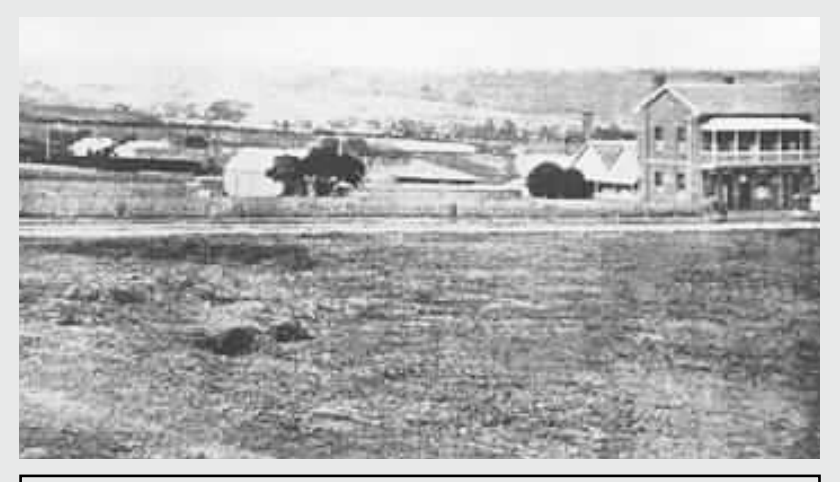
Malvern Hill Hotel and surrounding area soon after the closure of the Water Establishment c 1870. Reg No 1239

M.LaMoile advertised his business extensively "The Establishment is retired, elevated and commands an extensive view of the Bay and the Dandenong ranges; the neighbourhood is richly wooded; the grounds contain many appliances for the recreation and exercise of the Patients; the air is celebrated for its purity and bracing quality, the soil being sandy and gravelly; remarkably dry and healthy, allowing the free exercise of walking at all season."