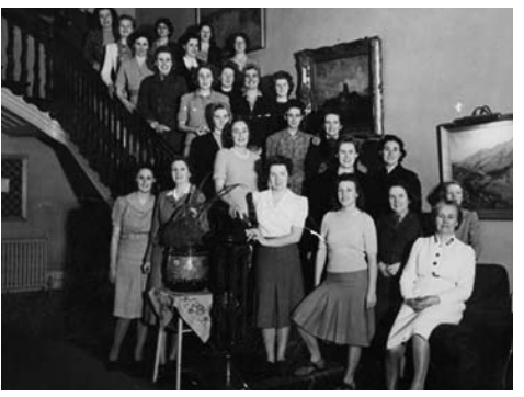
Heathfield Kooyong Road Toorak c.1944.