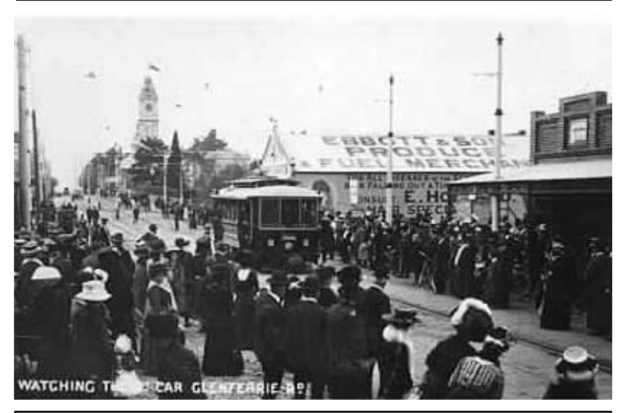
First tram passing the Ebbott Produce store, Glenferrie Road 1910. Reg no 1247