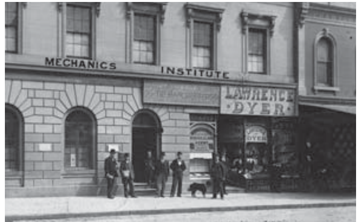
Prahran Mechanics' Institute in Chapel Street 1900 Reg No. 8545