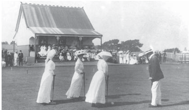
Opening Day Malvern Caulfield Recreation Club 1909 Reg No 1599.1