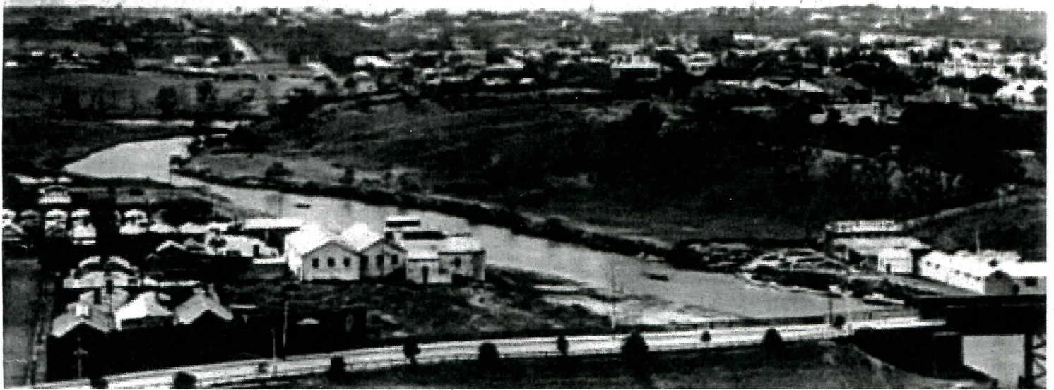
View looking south east from Church Street Richmond, showing the curve of the Yarra (later altered by the construction of Herring Island) c1914