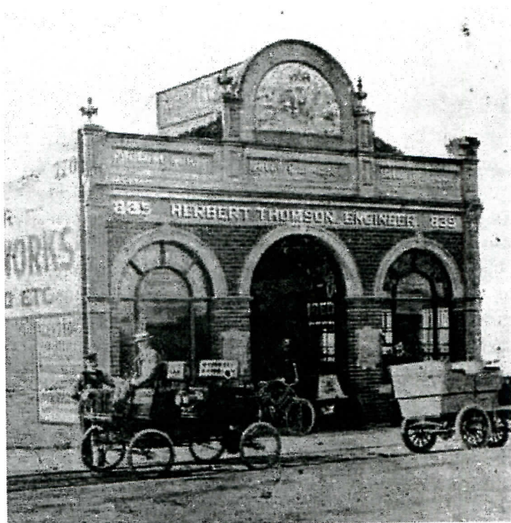
Thomson's Motor Works in High Street, Armadale 1906