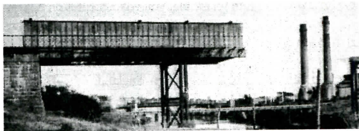
Dismantling the first Church Street Bridge 1921

Work is progressing on repairing existing Heritage Markers and replacing the ones that have gone missing! The Council has set aside funds in the budget to undertake this important catch-up work so that new markers can be commissioned in the coming year. The first to be installed within the next twelve months include the Stonnington City Centre (Malvern Town Hall), Mandeville Hall, Prahran Council, Church Street Bridge, Malvern City Square, Malvern Council, the Malvern Hill Hotel, Prahran Mechanics Institute, and Holy Trinity Church.