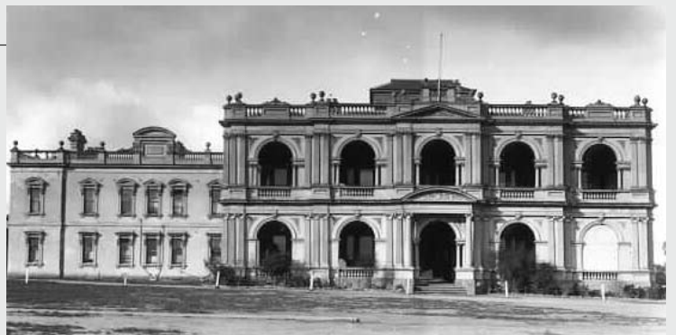
Harold Avenue Glen Iris c 1930. Reg No 290