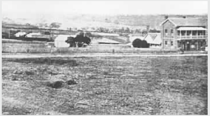
Malvern Hill Hotel and surrounding area soon after the closure of the Water Establishment c 1870. Reg No 1239

Although the connection of water to the district had been anticipated, LaMoile's business closed in 1865, four years before Yan Yean water reached the district.