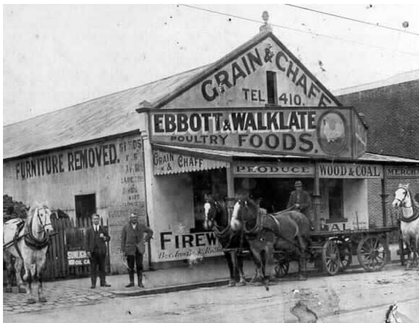
Ebbott and Walklate grain store, Glenferrie Road 1910. Reg no 513

The laneway between Claremont Avenue and Soudan Street has recently been named Ebbott Lane