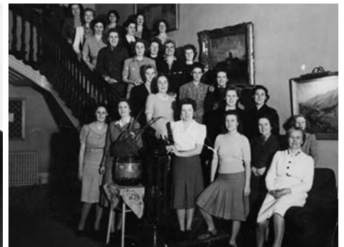
Heathfield Kooyong Road Toorak c.1944.