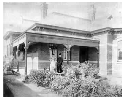
Manning House 101 Manning Road East Malvern c 1890. Reg No 6563