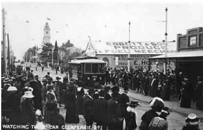
First tram passing the Ebbott Produce store, Glenferrie Road 1910. Reg no 1247