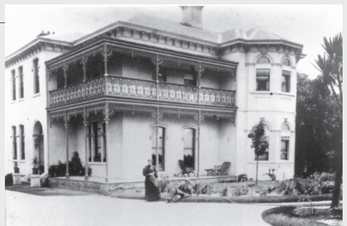
Kelmscott Huntingtower Road c 1900. Reg No 5208