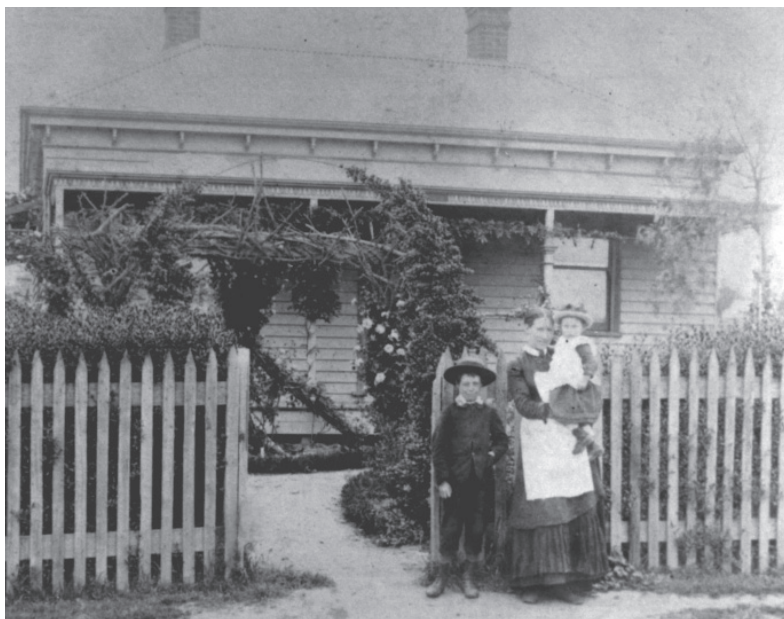
Pockett family at Hatherley c 1883. Reg no 6512

Pockett designed Malvern's first public gardens in High Street with serpentine paths and no straight lines or formal angular beds. A row of English Oaks was planted each side of the drive, and palms, elms and flower-beds were planted. The lawns and planting were arranged so that long views could be obtained through the gardens. Pockett's design also included a fish-pond with artistic grotto work and handsome fountain.