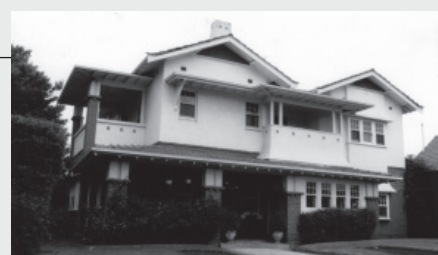
326 Wattletree Road 1994.