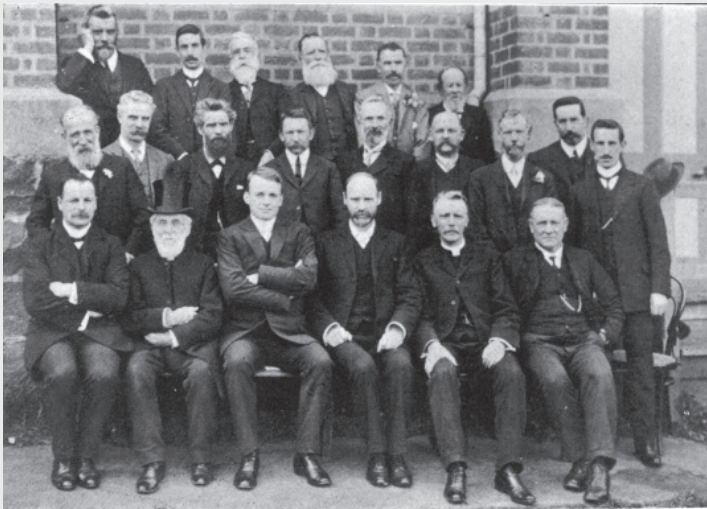
Circuit Ministers and Spring Road Officers 1910. Reg no 945

The Pryors have had a close relationship with Malvern for over 100 years. In October 2006 the laneway at the rear of shops in Malvern Road between McArthur and Cawkwell Streets was named Pryor Place.