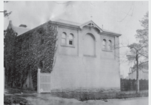
Garage and Chauffeur's accommodation for W.L.Baillieu, Albany Road c 1923