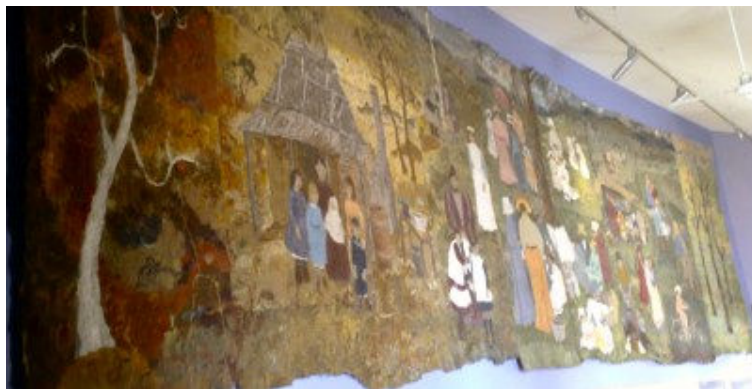
in situ at Mansfield Tourist Information Office