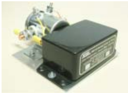
The SM155 battery link version is shown here

Who was the first person to look at a cow and say, "I think I'll squeeze these dangly things here and drink what comes out"? Who was the first person to say, "See that chicken over there ... I'm gonna eat the first thing that comes out if its butt"?