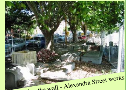
Rebuilding the wall - Alexandra Street works

The perimeter wall of the cemetery was in poor condition due in part to the invasion of the footings by the roots of the substantial Plane trees at the northern end of Alexandra Street. The City of Port Phillip has