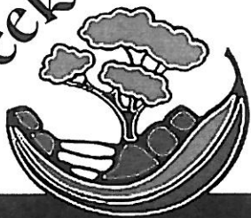
Merri Creek at Gaiardo Tambone.