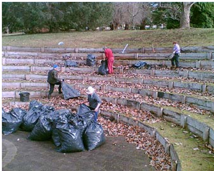
Freinds at work, Ryberg Amphitheatre Sept. 07.

The Yunan Poplar in the Ryberg Amphitheatre area drops quite a bit of debris along with leaf fall, causing rapid deterioration of the facility and surrounds. A little bit of TLC each year has improved the amenity of this area quite a bit. There are a total of 5 amphitheatres, built in 1985 by Artist and Sculptor, Jenny Saulwick as part of her Community Use Sculpture Project. They have been kept in good repair by park staff up until recently. However it seems that the deterioration rate has increased beyond their capacity to cope as needed repairs continue to accumulate.