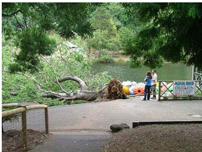
Three trees lost in a week due to wind, April 07.

The Friends will be applying for a grant for advanced trees to replace many of the removals that have occurred over recent years. Council have spent many thousands to remove trees on the basis of safety to the public. It is hoped that a grant will be made available to re-populate many of the open areas that have been created. It is possible that safety has been compromised as the openness encourages unusual wind gusts in directions that the remaining mature trees have not adapted to. For instance we had three trees blown into the lake within one week in April (see below). I watched this one fall at aprox 8:00am on the 11th April from the footbridge and the wind was not all that bad. Possibly it had been weakened by overnight gusts.