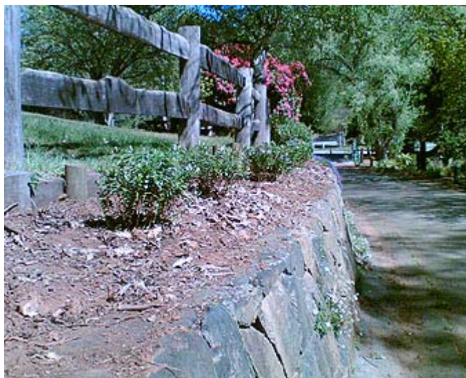
Along the poolside wall Oct 07.

It was decided to replant some of the hedge with a similar variety of the better growing sections. It is hoped that this will eventually make the hedge more uniform and spectacular. The removed plants were relocated elsewhere. A lot of work has been done in this area by the Friends and park staff. It is expected to be very popular spot for picnickers in the coming Summer season, although there is only a single BBQ facility nearby.