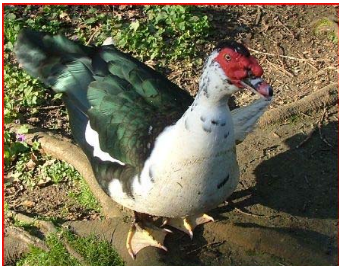
"Plucka" the friendly duck. Sept. 07

Early in August this bird appeared in the park. Most probably dumped, presumed unwanted by it's former owner - not nice. Initially timid as would hide under the hybrid oak near the old waterslide bridge. So far has avoided capture and seems to have settled in for the duration. "Plucka" has become quite popular and is well fed by almost everyone. He has a deformed wing but this does not cause him any discomfort. He has a friendly disposition and Waggles his tail like a dog when approached.