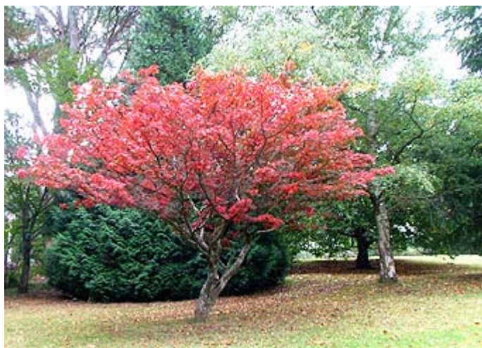
May 01st the Calendar Maple.

Preparations for next season, and new facilities have been made by the removal of the old playground and the old water slide - finally! The friends will be looking forward to any new planting in this area when it is reformed. Any new members that would like to join us and take part will be most welcome.