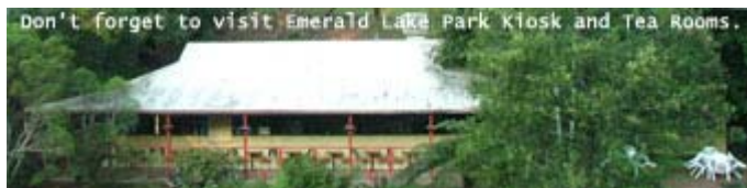
Don't forget to visit Emerald Lake Park kiosk and Tea Rooms.

The chart above shows the comparative rainfall for the last five years. The park recieved almost average rain for the Month of May. According to the weather man 95 millimeters is average for the Ranges in May. The very poor falls in February and April have severely compromised this years expectations. Hopefully we will have better luck in the remaining months to December.