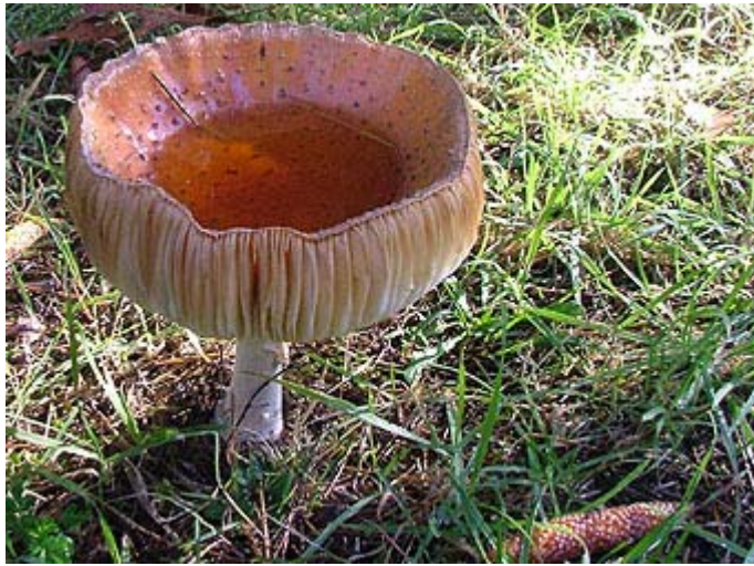
Magic Mushroom 30th April 2007.

Over the last few years as a matter of inexpert interest, I have been taking regular measurements of a particular Pin Oak circumference. It may interest local tree growers to know the results. In the last two years the rate of growth has been identical, 8.1cm change in circumference or an increase of 2.6cm in diameter, that's more than an inch. Maximum growth is between 1st October to 1st of April the following year, the remaining months is static with even a slight shrinkage in April?