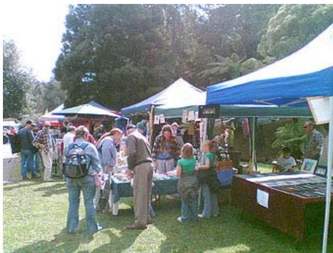
Quality Produce Market.

A careless driver travelling at speed along the park entrance road towards the main rail crossing was witnessed at distance by a following operator driver and subsequently several dead Black Ducks were discovered on the road. Unfortunately the offending driver was not confronted due to the lack of evidence attaching his car with the event. Drivers are asked to observe the speed signs as the park wildlife is particularly tame and undisturbed by the presence of people and vehicles.