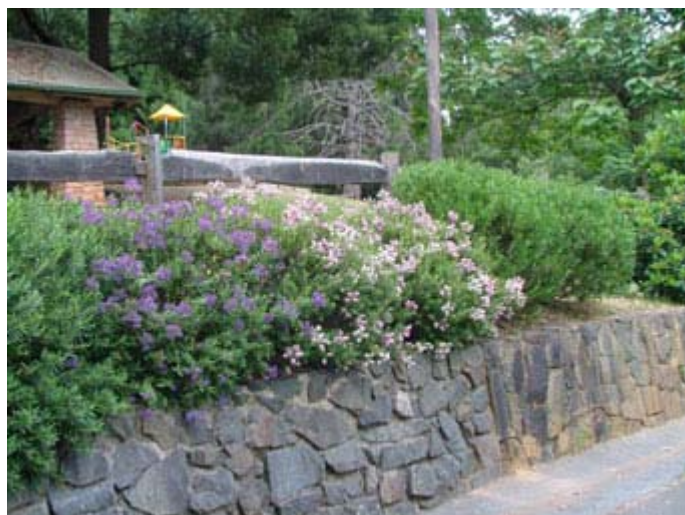
Some results of our planting and care, photo Dec. 06.

The obvious success of the Hebe hedge along the wall at poolside has been considered and this has now been extended right up to the steps at the North West end. We look forward to the growth of this catching up with the remainder of the plants that now dominate the area. Originally the hedge was to obviate the need for a fence to prevent children jumping down off the wall. Growth was a bit slow and so the rustic wooden fence was erected some time ago. The area now looks great esp. when in flower in December as the photo below shows.