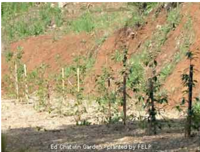
Lakeside Car Park planting.

Much work has been done in the popular areas of our park. Restoring abandoned garden beds, replanting of existing beds, mulching weeding and watering. Its great fun and has its rewards of community, achievement and social interaction.