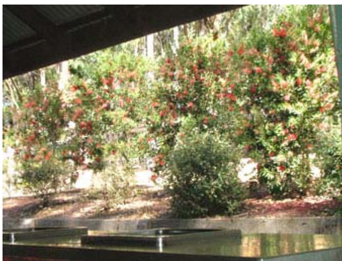
Messmate Shelter garden area.

Cuttings from trees and tree removals have provided a large volume of wood chip mulch. Spread by the friends on bare surfaces in the Puffing Billy car park and Messmate areas. It makes for a cleaner surface and reduces erosion when we do get rain. Used as a mulch for plantings of native vegetation and the gardens around the Messmate Shelter again helps with moisture conservation and growth.