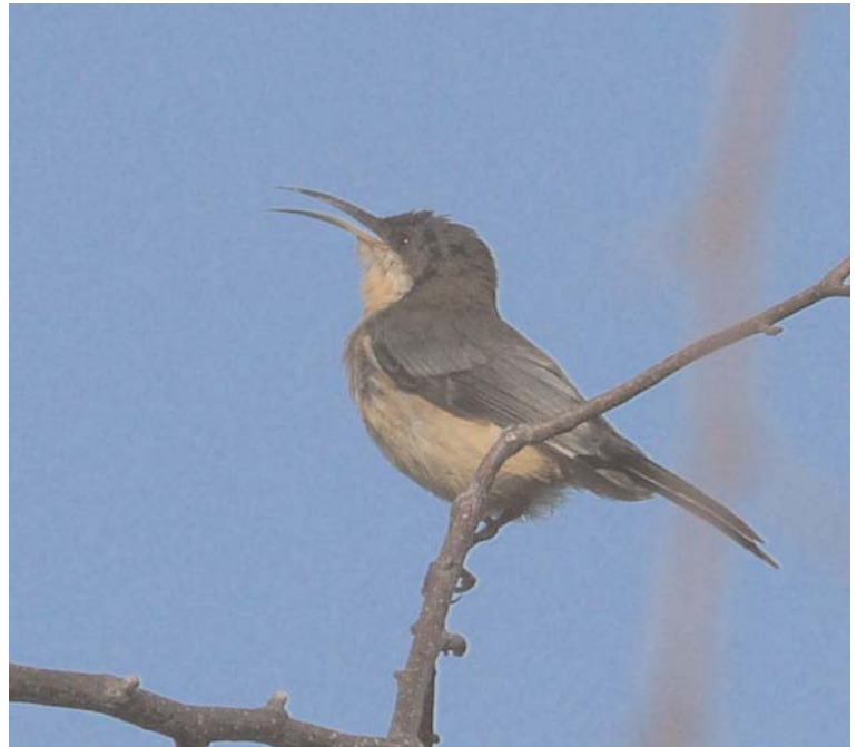
Eastern Spine Bill