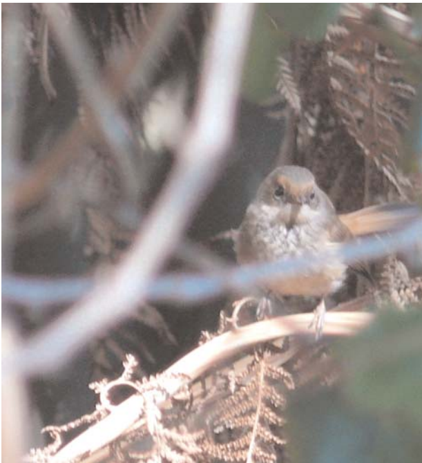
Rufous Fan Tail