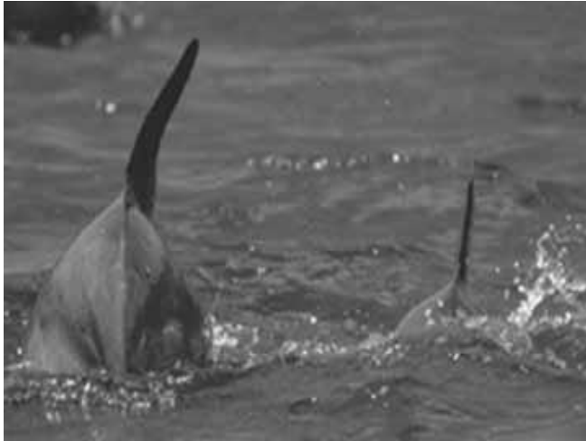
Bent Fin with Calf