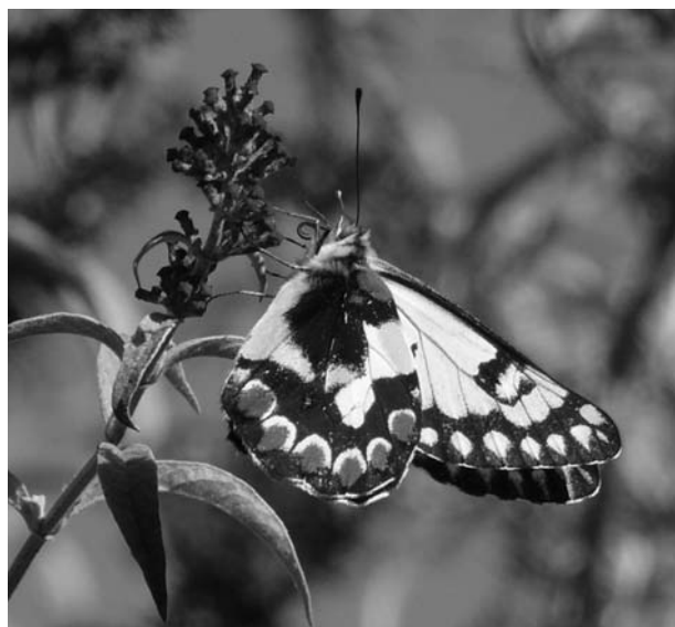
Wood White Butterfly

The penguin team has been collecting feathers as a record of any toxins or heavy metals the penguins may be carrying.