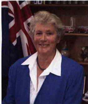
JOANNA GASH MP Federal Member for Gilmore

PARLIAMENT OF AUSTRALIA House of Representatives