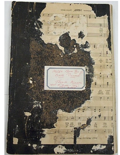
The cover of the notebook