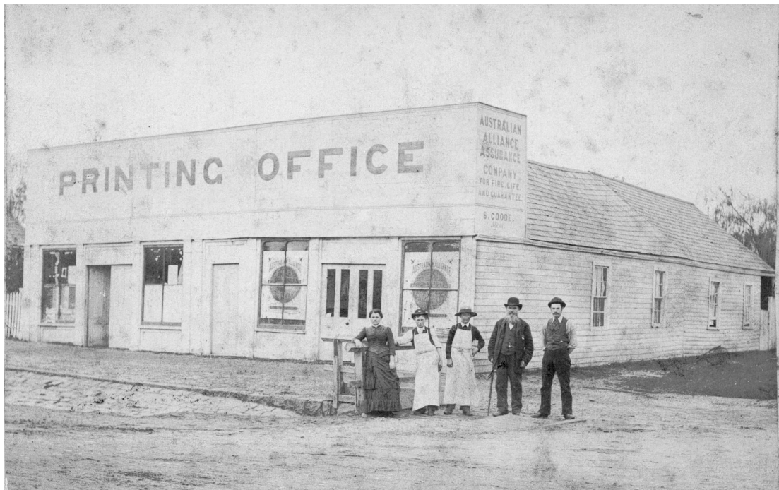
Members of the Goode family outside the printing shop in Warrenheip St, c. 1870s