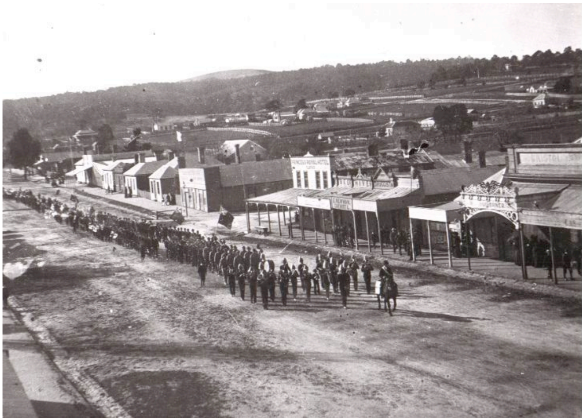
Warrenheip St early 1900s, showing the large premises of the Buninyong Telegraph on the corner of Forest St, opposite what is now the garage corner.