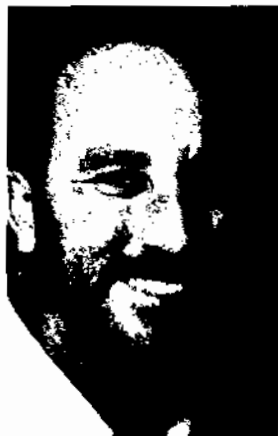
Parks Victoria Ranger

If you are lucky you may catch a glimpse of a Lyrebird scratching about amongst the leaf litter looking for insects and grubs. Their clear loud imitations echo through the forest. The park is also home to the Common Wombat, Swamp Wallaby, Greater Glider, Sugar Glider, Brush-tailed Possum and Platypus.