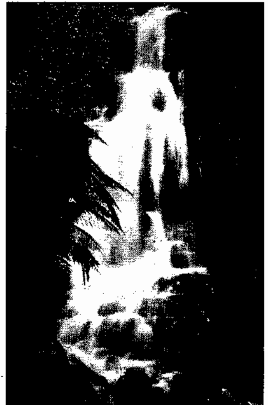
Cyathea Falls, Tarra Valley

Meander through a rainforest gully and across trickling mountain streams to Cyathea Falls. The Ancient Myrtle Beech along the trail creates a protective canopy above a delicate understorey of tree ferns, lichens and moss.