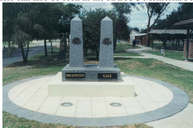
Breavington and Gale Memorial – RAAOC Memorial Park, Bandiana, Vic.